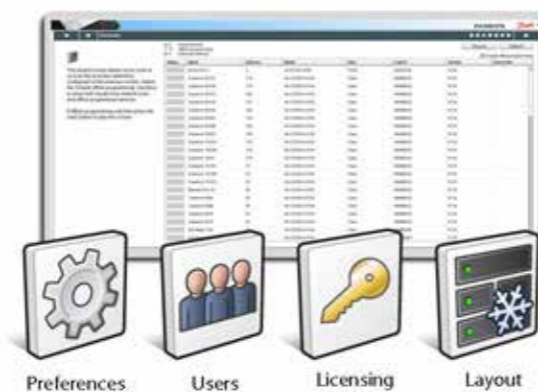
Available web wizards to assist in the commissioning process

We understand when developing a global controls platform there is a real need to cater to the Engineering activities that are required to bring a store controls systems to life. Fortunately, the System Manager makes available configuration web wizards. The designated web wizards are intended to assist the user in a step by step format, offering clean screen formatting and drag and drop functionality. The net result is improved commissioning times and less chance of configuration errors.