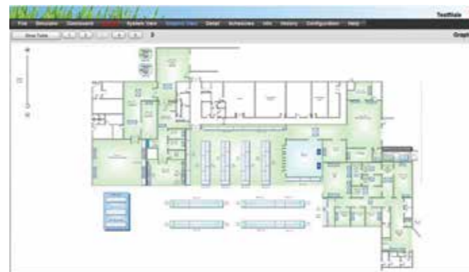
Custom graphics, available in local screen and Web browser

Whilst utilizing web browsers and web technology is nothing new in the controls world, the System Manager attempts to actually take advantage of this technology and present system information in a meaningful and rich way. Unlike many of the products in the market today, the System Manager does not simply show a range of data tables in mash of browser screens, rather, it presents a fluid blend of dashboard, automatically generated system graphics and asset detail screens. Whether its a history log, current status or setpoint changes, all actions are easily achieved in one flowing web experience.