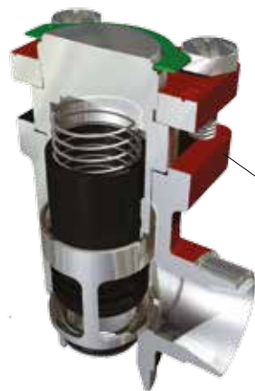
Standard SVL housing

SCA is a check valve with a built-in stop valve function. CHV is a check valve only. The valves are designed to open at very low differential pressures, allow favorable flow conditions and are easy to disassemble for inspection and service. SCA valves are equipped with vented caps and have internal back seating, enabling the spindle seal to be replaced whilst the valve is still under pressure. Laser cut V-ports provide excellent opening characteristics. The valve cone has a built-in flexibility to ensure a precise and tight closing towards the valve seat. A well-balanced dampening effect between the piston and the cylinder gives an optimal protection during low loads and against pulsations.