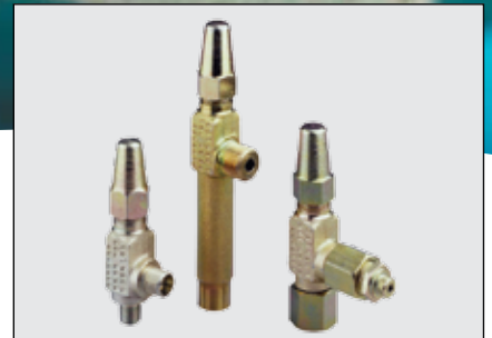
All valves in low temperature steel