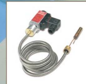
Temperature monitoring & control

The PT100 sensor insert for MBT 5250 and MBT 5252 can be replaced in situ i.e. without the need to remove the sensor from the application. This is particularly useful in tank applications where drain down of the tank would otherwise be necessary. Optional Stainless Steel sensor pockets are also available for the temperature transmitter MBT 3560 which also enables the product to be replaced in situ.