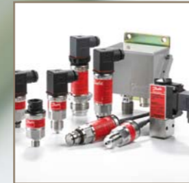
Pressure monitoring & control