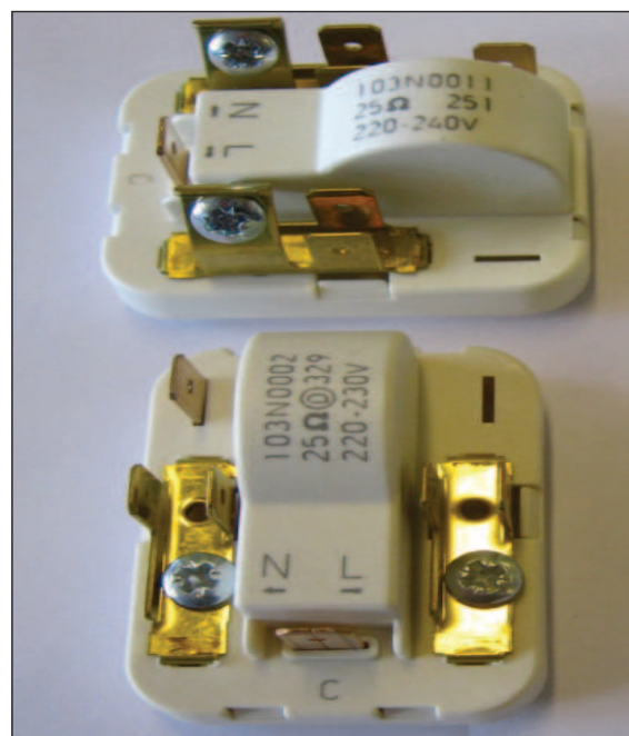
Fig.2 Example: PTC starting device 103N0002 to be replaced by PTC starting device 103N0011