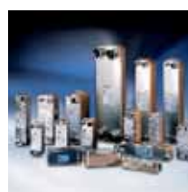
Brazen plate heat exchanger

We are offering a single source for one of the widest ranges of innovative refrigeration and air conditioning components and systems in the world. And, we back technical solutions with business solution to help your company reduce costs, streamline processes and achieve your business goals.