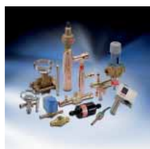
Controls for Commercial Refrigeration

We focus on our core business of making quality products, components and systems that enhance performance and reduce total life cycle costs – the key to major savings.