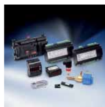
Electronic Controls & Sensors