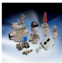
Controls for Industrial Refrigeration