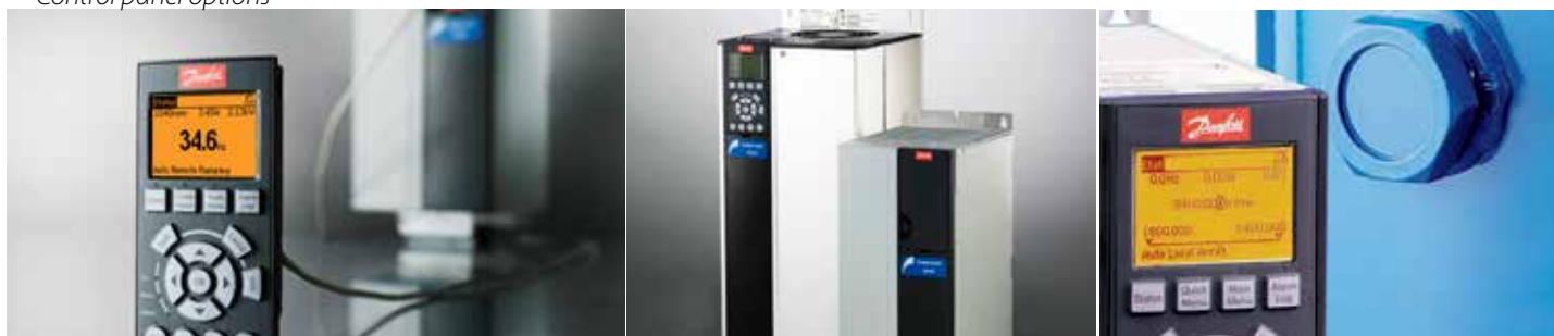
Control panel options

provided by the speed reduction at night and the limited number of starts and stops.