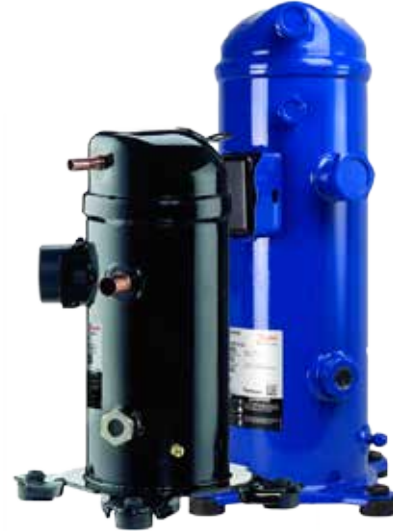
MLZ compressors may be blue or black depending on the manufacturing origin