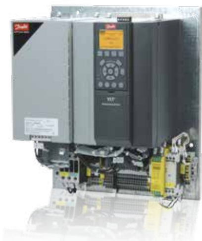
Danfoss' Chemical module provides the necessary protection when used with Ex motors.