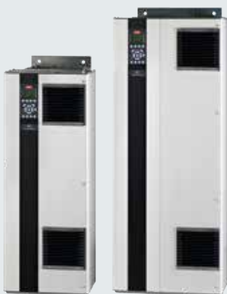
The new D-frame enclosures are the smallest in their class.

After you select your configuration, Danfoss supplies a fully assembled and tested unit from its advanced production facility.