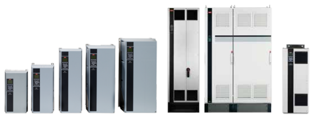
VLT® AutomationDrive FC 302, VLT® AQUA Drive FC 202 and VLT® HVAC Drive FC 102