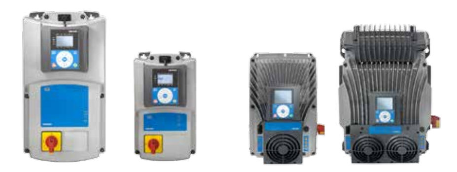
VACON® 20 X