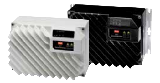
VLT® Decentral Drive FCD 302