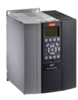
VLT® Lift Drive LD 302