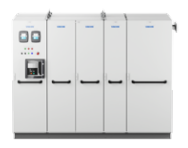
VACON® NXP Liquid Cooled Enclosed Drive