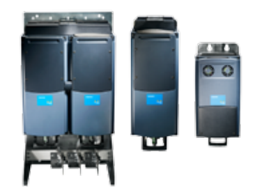
VACON® NXP Liquid Cooled Common DC Bus