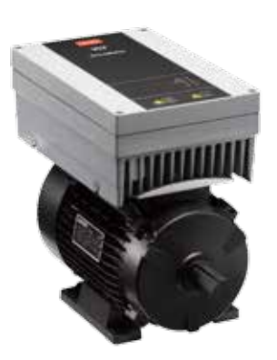
VLT® DriveMotor FCM 106