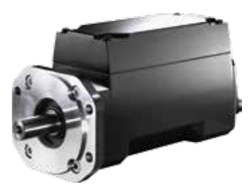
VLT® Integrated Servo Drive ISD 410 System