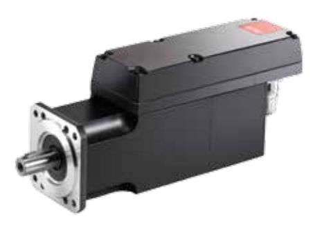
VLT<sup>®</sup> Integrated Servo Drive ISD 510