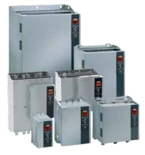
VLT<sup>®</sup> Soft Starter MCD 500