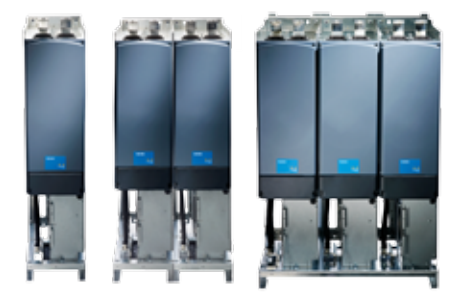
VACON® NXP Grid Converter