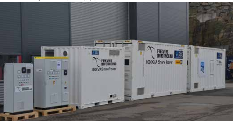
A range of the shore power supply systems from SEC and Frekvensomformer.no.

“We have the capacity to supply one rig, currently the COSLPioneer, with clean shore power. In the future our goal is to expand capacity to supply all rigs with clean power – so we will definitely invest in more systems in the future”.