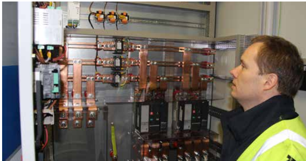
Wiring field with good access. Also the ventilation fans for the container are powered by VACON® drives.