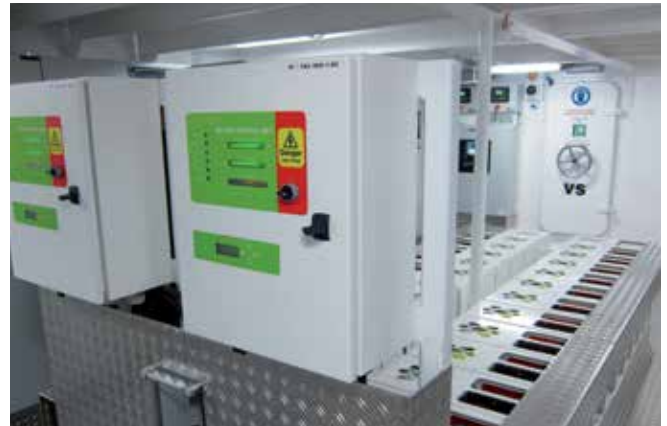
The 2 x 68 kWh Li-Ion EST-Floatch Battery system with battery management system.