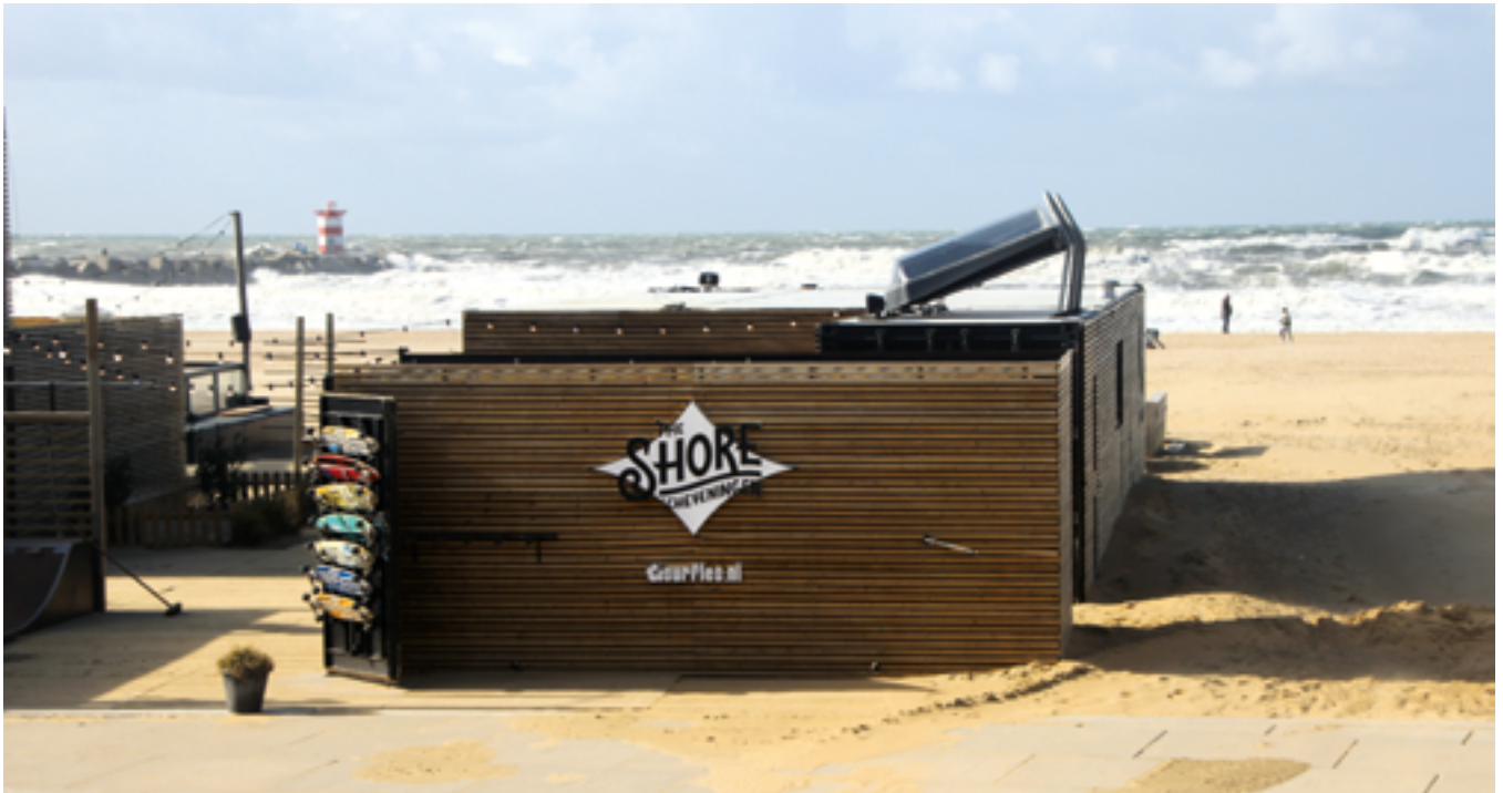
Scheveningen is the Dutch Surfer's Paradise where the citizens and visitors enjoy the clean air and the waves.