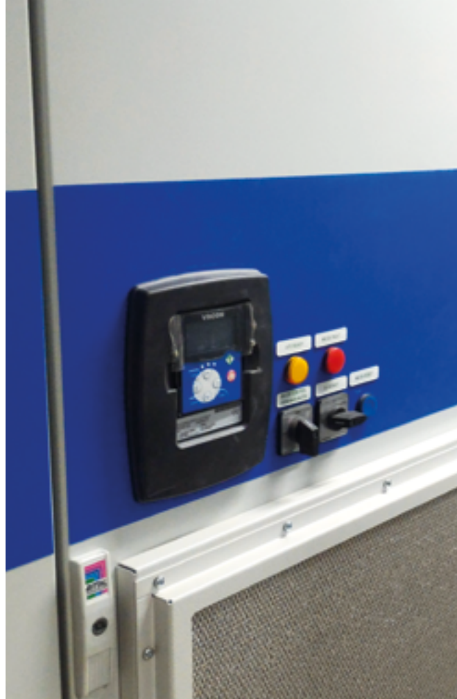
The VACON® NXC series low harmonic drive delivers a total power of 2 MW.