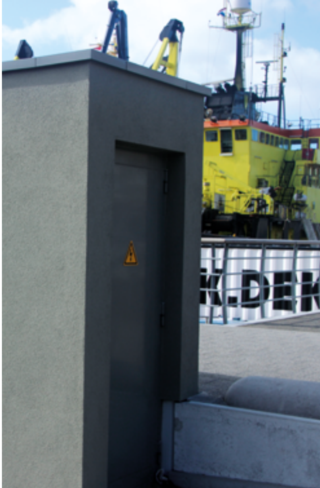
The shore power supply system is located underground. Here only the entrance is visible.