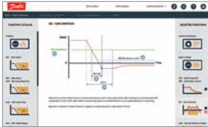
Convenient PC-based VACON® Safe user interface.

To customize the safety application, adapt the settings of safety parameters. To configure via software, use the VACON® Safe PC tool.