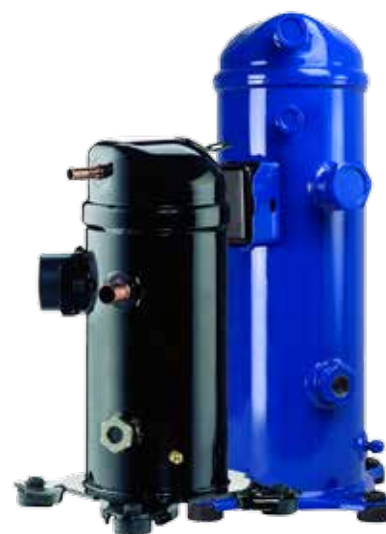
MLZ compressors may be blue or black depending on the manufacturing origin