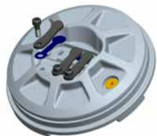
The innovative reed valve design allows energy savings and an extended envelope.

A new heat pump system fitted with a Danfoss Heat Pump Scroll compressor is the perfect solution to meet today's high expectations of highly energy efficient products – especially for the renovation sector. With its reed valve design to optimize yearly energy efficiency and heat pump optimized scroll set, the Danfoss Heat Pump Scroll compressor outperforms the competition.