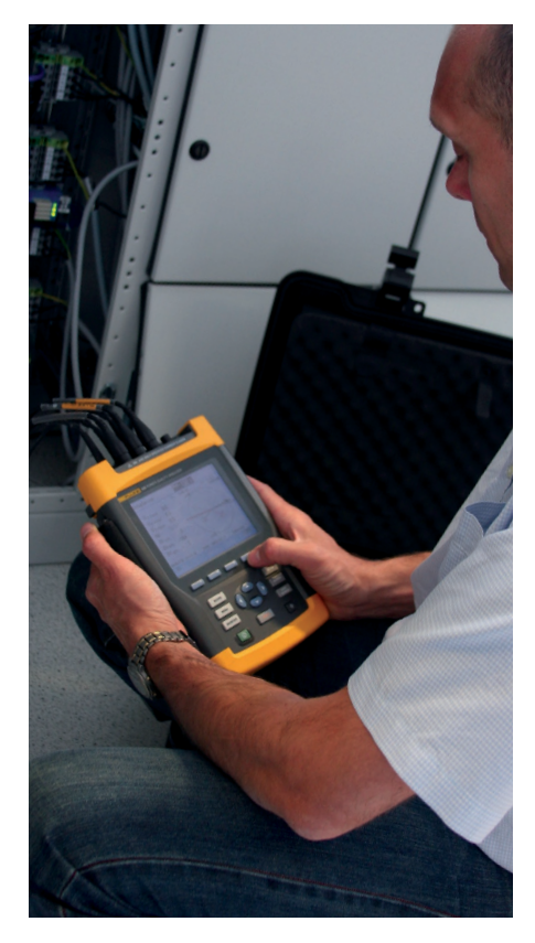
Danfoss provides design support to recommend the most suitable harmonics mitigation solution for each project. When relevant, Danfoss support includes an on-site harmonic survey.

*With exception of VLT® Micro Drive FC 51 rated 7.5 kW or less, – where an external mitigation solution is available.