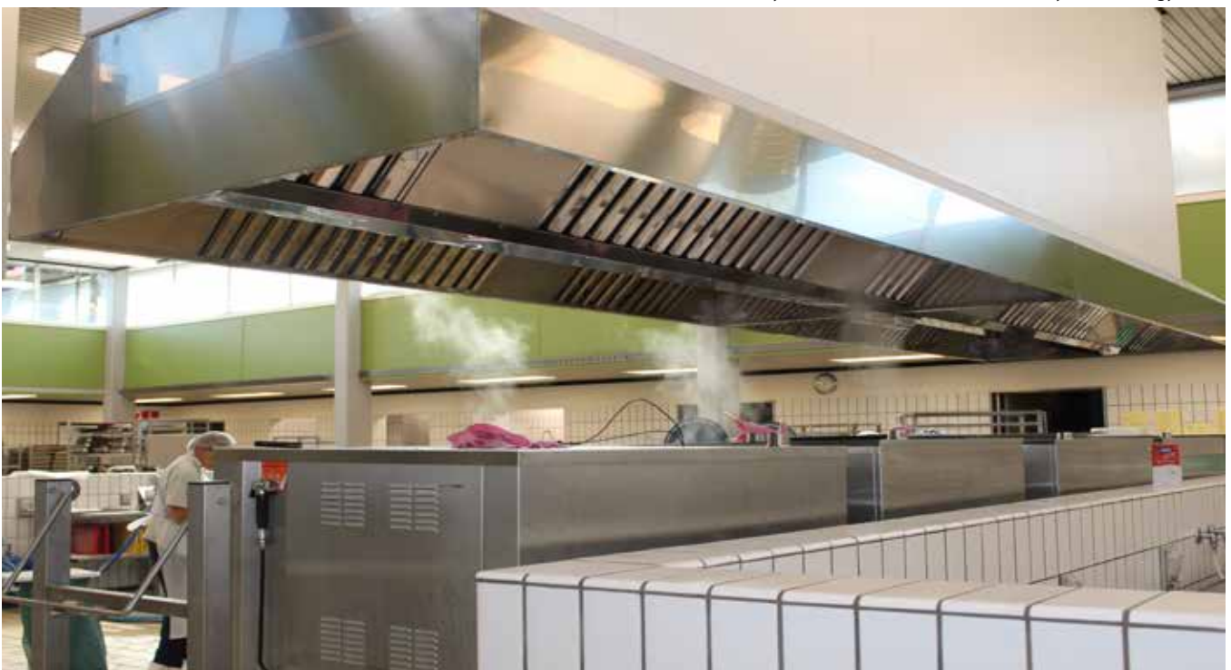
The new ventilation system includes a renovation of the ventilation room for the industrial kitchen, as well as a new ventilation system for the basement and nearby dermatology clinic

The extreme compactness of modern drives also enables side-by-side wall or cabinet mounting. Comparing the VLT® 5 drive to its current equivalent, the volume reduction is a massive 80%.