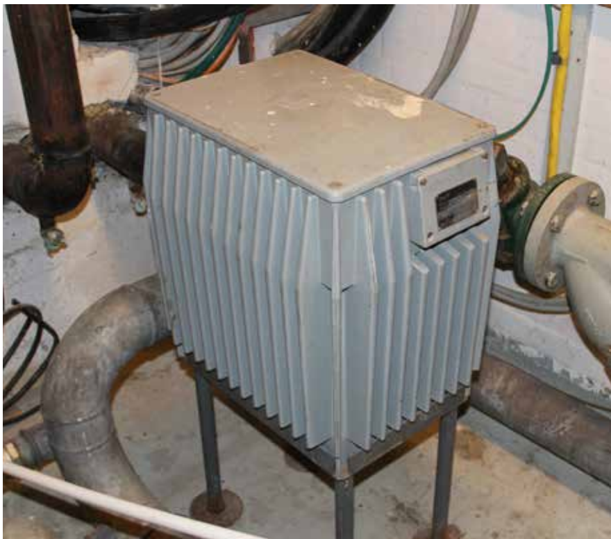
This VLT® 5 drive model in aluminium housing was introduced in 1973. At the Municipality of Tønder in Denmark it has ensured reliable, low-energy ventilation for more than 40 years.

Danfoss is the global expert in HVAC drives, and has supplied a range of industries with more than 2.5 million dedicated VLT® and VACON® HVAC drives since 1986, when the first dedicated VLT® HVAC Drive was launched.