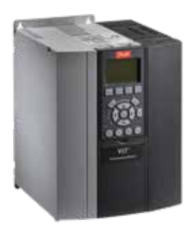
VLT® Lift Drive LD 302