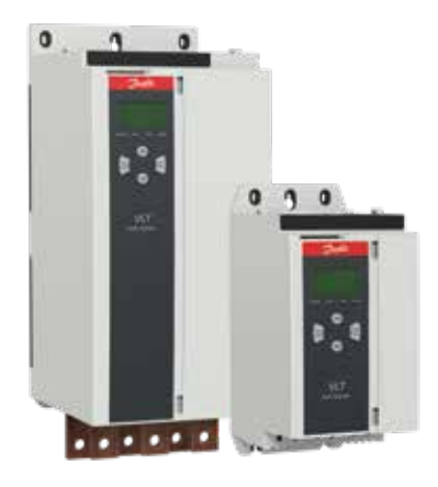
VLT® Soft Starter MCD 500