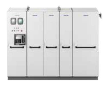
VACON® NXP Liquid Cooled Enclosed Drive