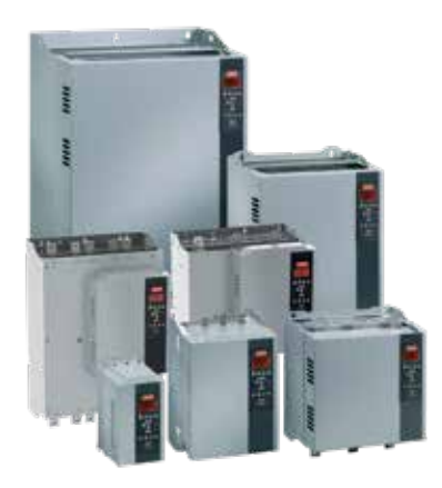
VLT<sup>®</sup> Soft Starter MCD 500