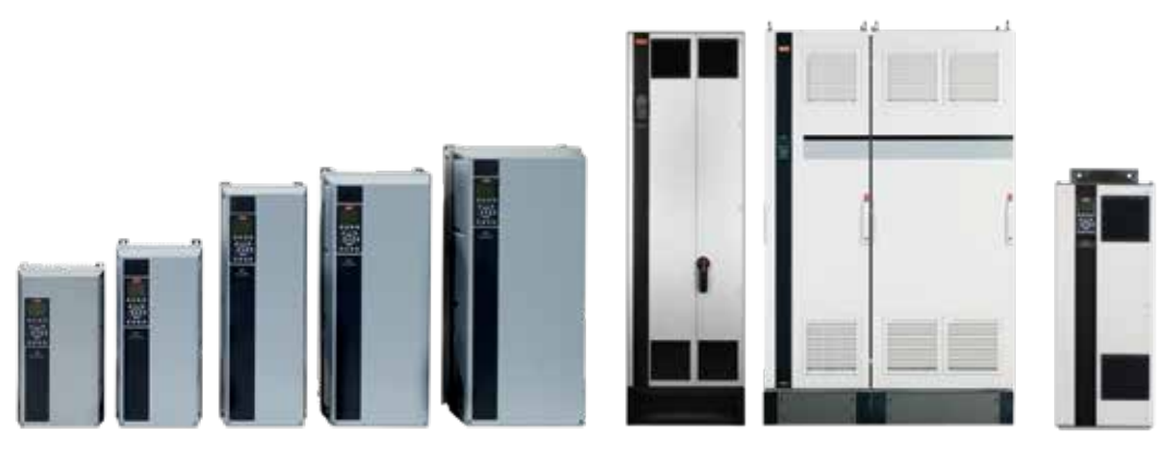
VLT® AutomationDrive FC 302, VLT® AQUA Drive FC 202 and VLT® HVAC Drive FC 102