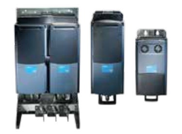
VACON® NXP Liquid Cooled Common DC Bus