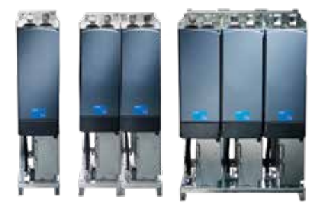
VACON® NXP Grid Converter