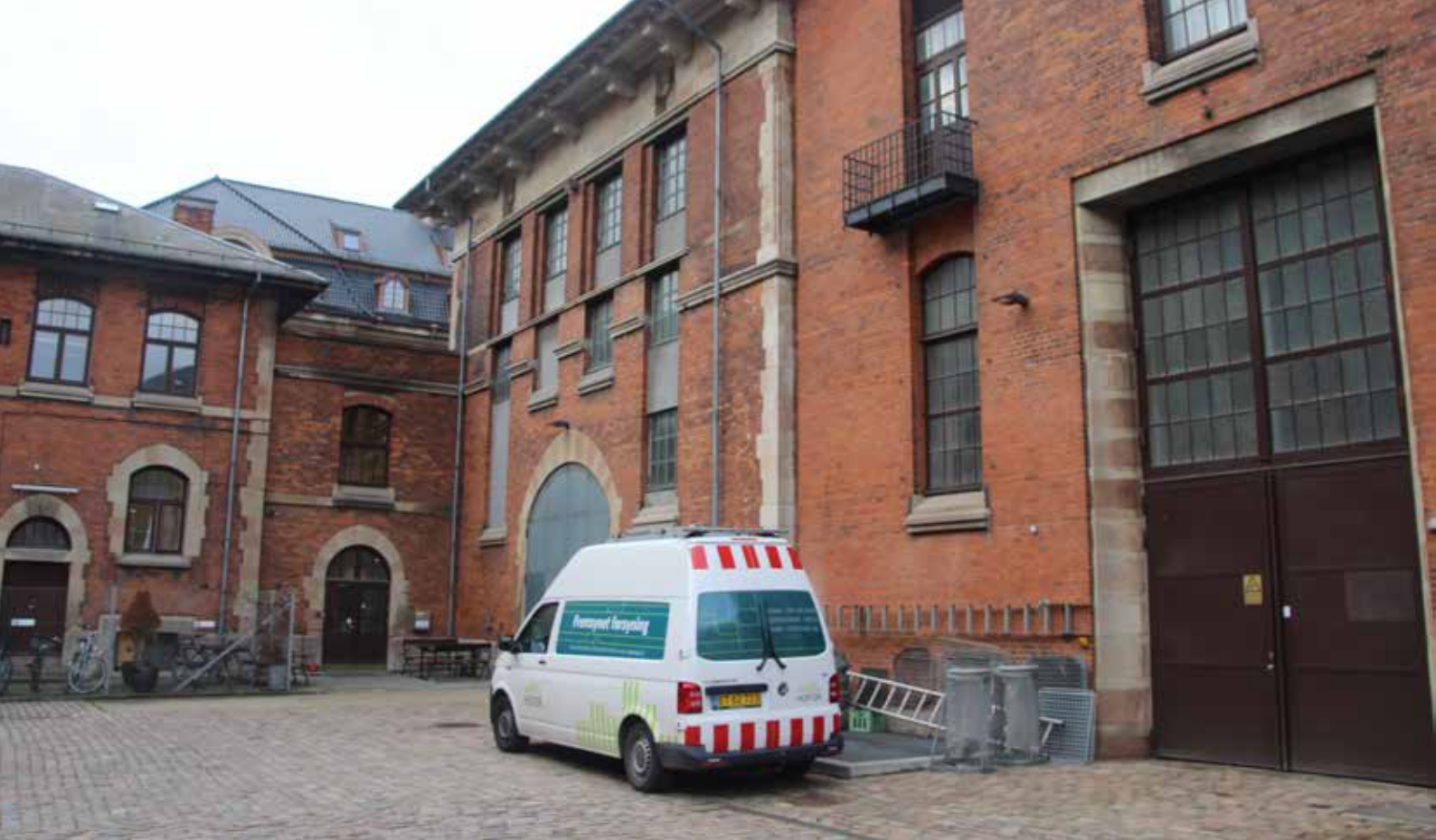
This building in Tietgensgade, previously the Venstre Elektricitetsværk power plant, is now converted to a cooling central for HOFOR. It supplies businesses and institutions in Copenhagen with energy-efficient and environmentally friendly cooling, based on seawater pumped up from Copenhagen Harbor.