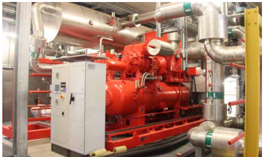
VLT® drives regulate the capacity of all pumps and compressors with impressive stability. Uptime is optimized and there is 99.98% security of supply.

"We are getting a lot of feedback from customers who are so happy to have got rid of their noisy roof-top chillers. And customers who have replaced their old air-conditioning facility with the much smaller receiver setup can now put the freed-up space to better use. We have seen several places where the square metres they have gained have been transformed into a roof terrace, which is very attractive for residents, and increases the value of the property," says Admir Omeragic.