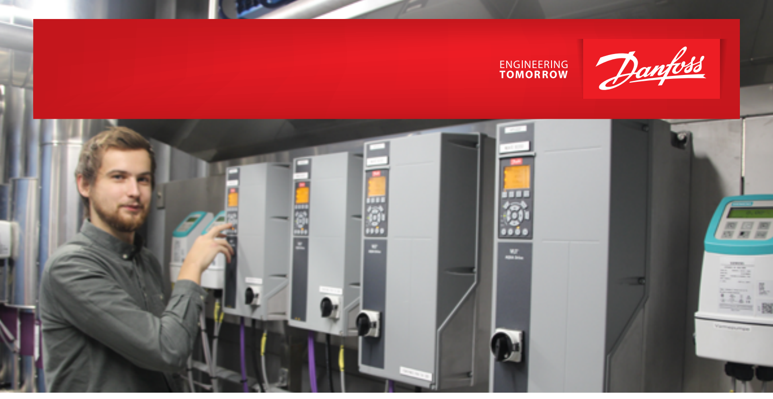
VLT® AQUA Drive units can accelerate the heat pump from minimum to maximum performance in just a few minutes, while the electric heater can be adjusted upward in a few seconds, explains Tore Gad Kjeld.