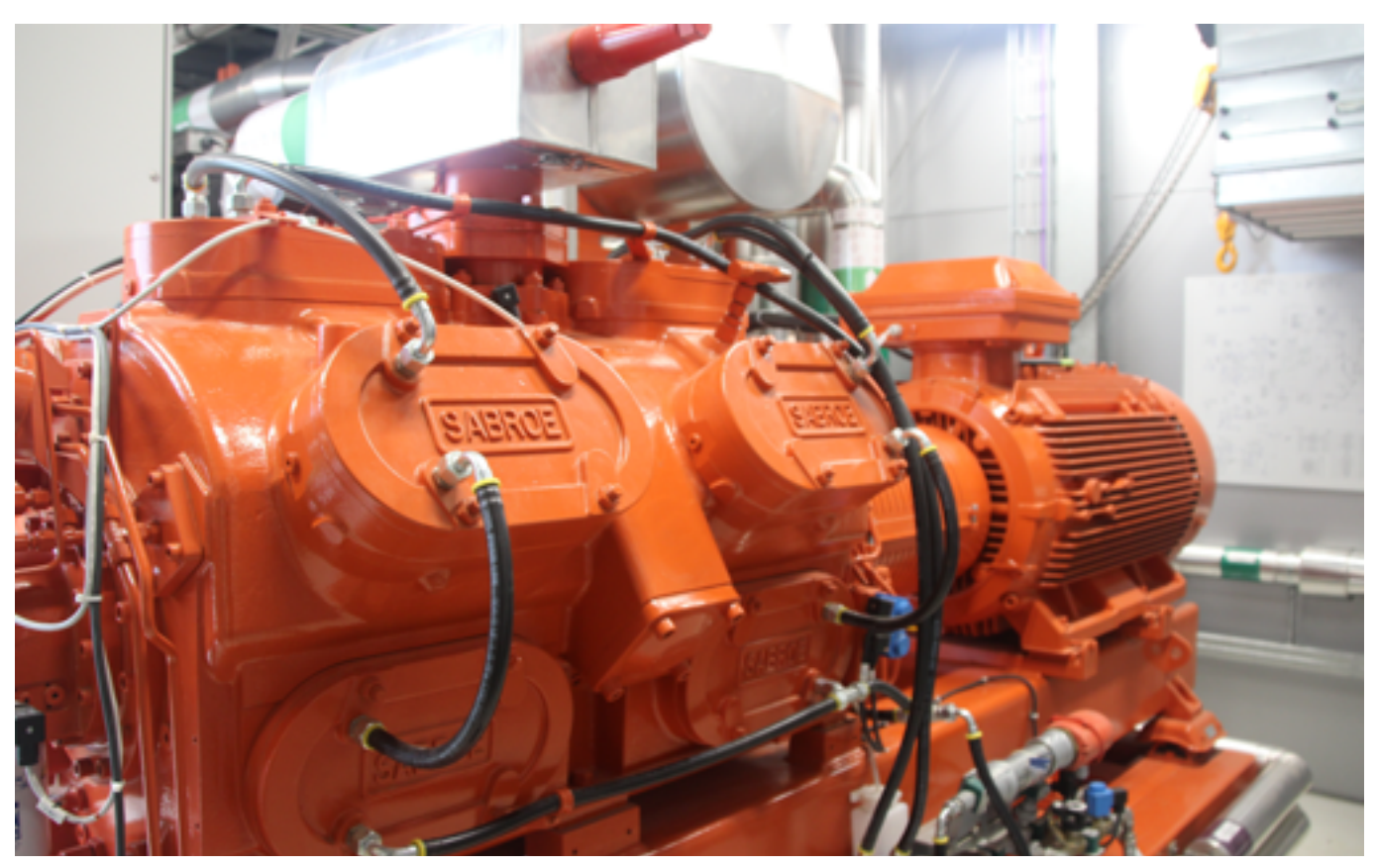
The variable speed drive-controlled heat pump sends 70^{\circ} C – 80^{\circ} C water out into the system, and approximately 40^{\circ} C water comes back to the plant. The plant was supplied and installed by Johnson Controls Aps with consultancy from COWI A/S.

the district heating supply, where heat pumps with thermal storage use the power when it is plentiful and therefore inexpensive; and avoid using it in periods with peak loads in the system, for example, late afternoon, when most people come home from work and turn on lights and household appliances. HOFOR's FlexHeat project in Copenhagen's Nordhavn is a prime example of this type of sector coupling. The thermal energy storage corresponds to a "virtual battery" of 4 MWh.