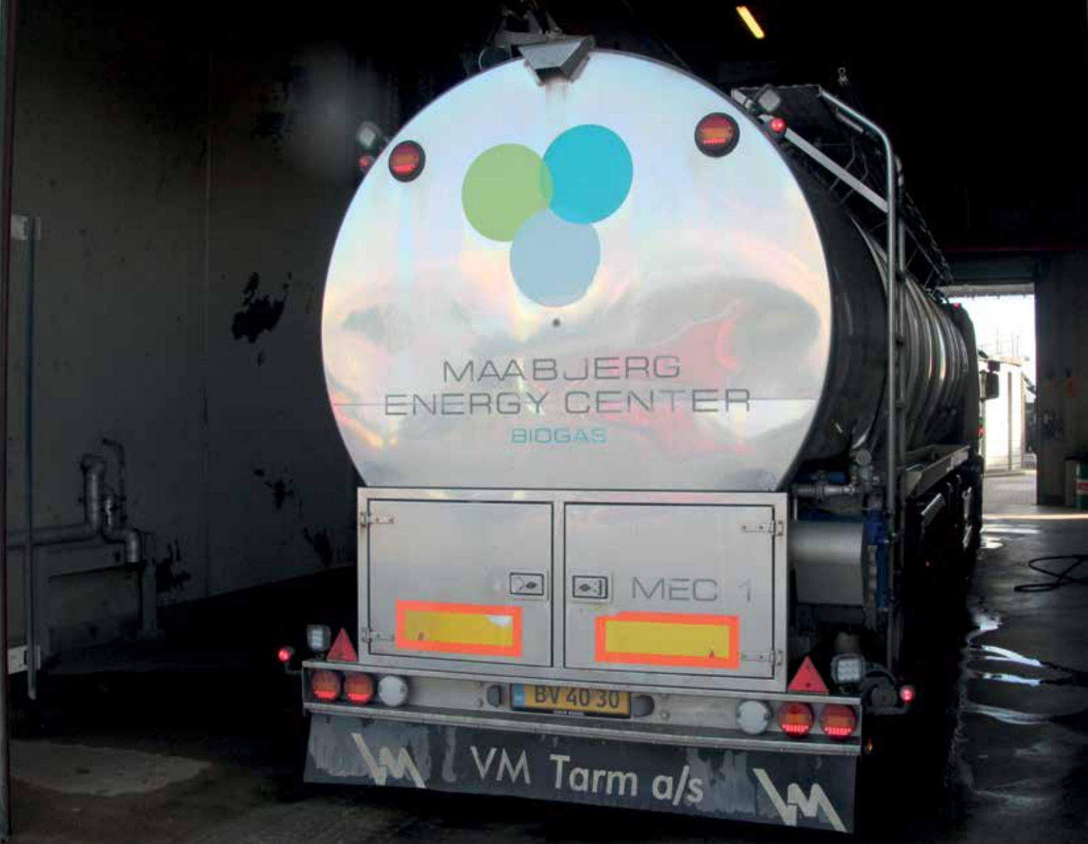
VLT® AutomationDrive FC 302 controls critical applications, such as pumps, blowers, decaners and screw conveyors, and ensures reliable operations at MEC – BioGas.