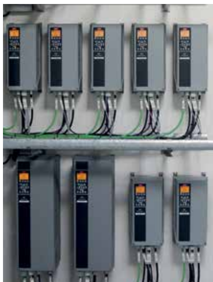
MEC – BioGas has used enclosure rating class IP55 for a number of their VLT® AutomationDrive FC 302 drives, because this type is especially suitable for installation in demanding environments.