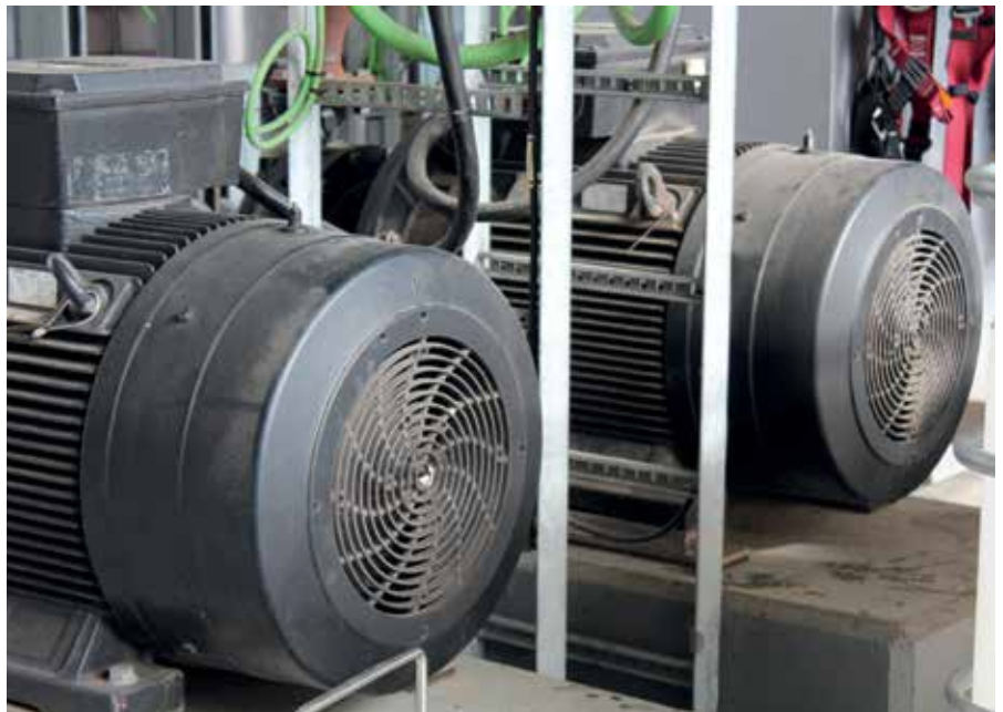
The VLT® AutomationDrive FC 302 drives control the large district heating pump systems.