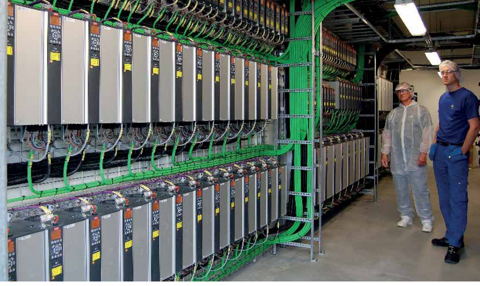
The 1400 VLT® drives are mounted in a series of well-ventilated control rooms, with no need for cabinets. From left Knud Rahbek and maintenance manager Simon Arentoft