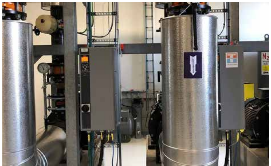
The entire plant is powered by 27 Danfoss VLT® drives in the range from 0.75 to 400 kW.

With the new Taarnby district cooling facility, the ambition is not only to deliver an environmentally friendly cooling alternative to private roof-top chillers, but also a more economical solution. Combining the production of district heating and district cooling in one and the same facility was one step. But placing the energy plant and