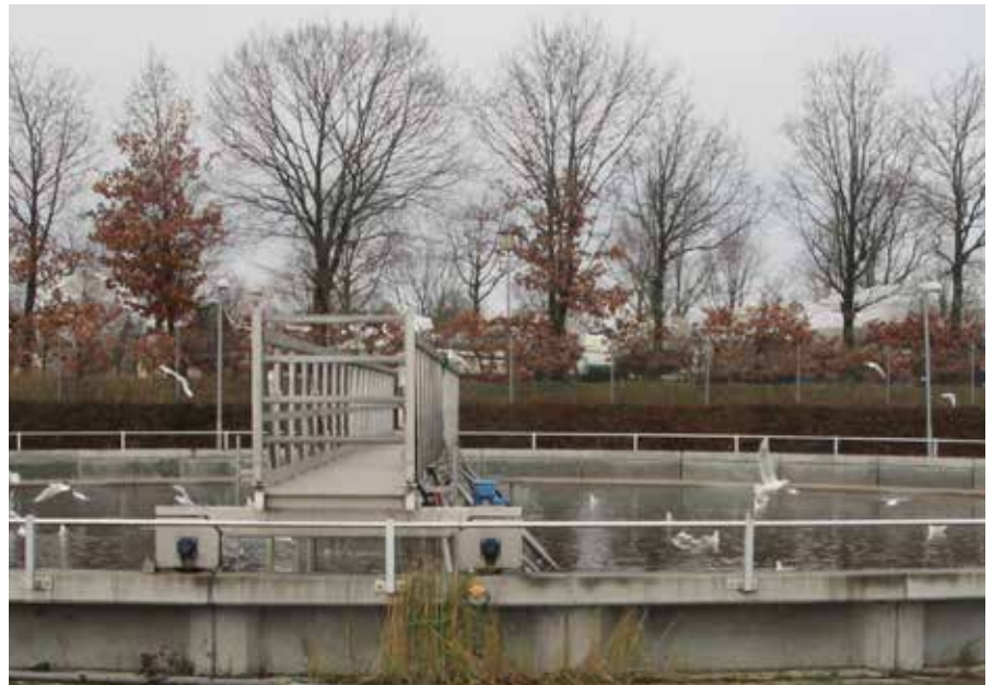
The Taarnby district energy plant is located in the outskirts of the Taarnby waste water treatment plant

The new Taarnby facility is located in an area close to Copenhagen Airport and has been operative since