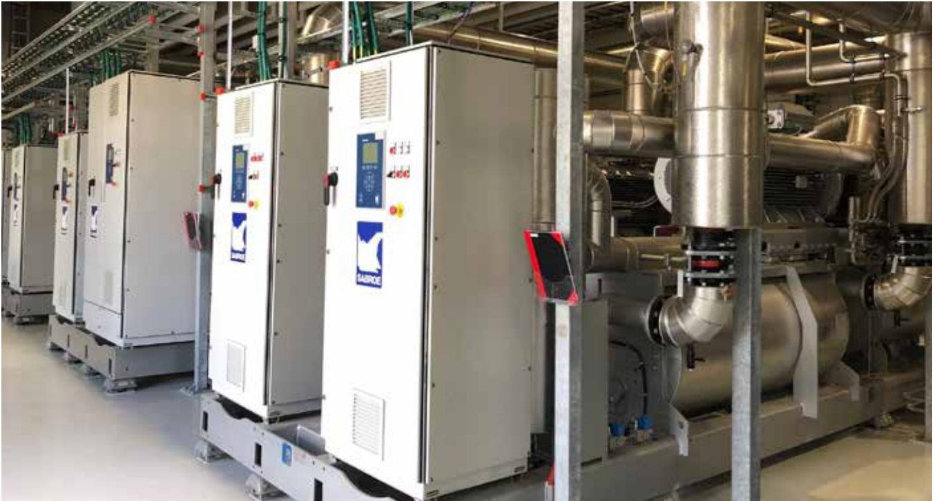
The variable speed controlled Sabroe® heat pumps supplied by Johnson Controls

building owners, Taarnby Public Utility and the heat transmission company CTR. Cooperation between these stakeholders and a mutual ambition to seek out an environmentally friendly and cost-effective solution has been key to the development and implementation of the Taarnby facility.