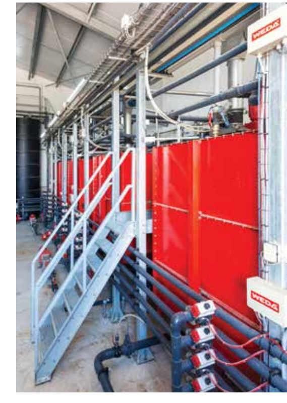
Weda fermented wet feeding system