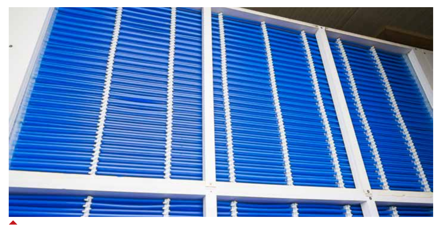
Exegy corrosion-free heat exchangers installed by Inno+ as part of the advanced climate and heat recovery system.