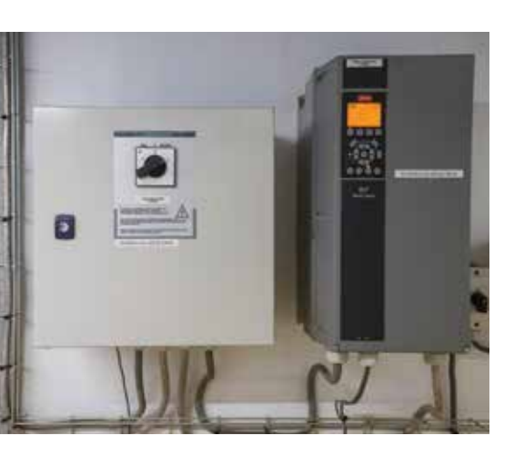
A robust IP55-rated VLT® drive controls the Stienen climate solution equipment.

His combination of sustainable entrepreneurship and a genuine passion for pig farming has proved to be a successful model for how modern farms can be run in an increasingly competitive international market. In fact, his company, the Van Asten Group, now has six locations in Holland and Germany – with an annual turnover of 70 million Euros.