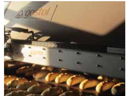
Gostol's reference bakery in Romania