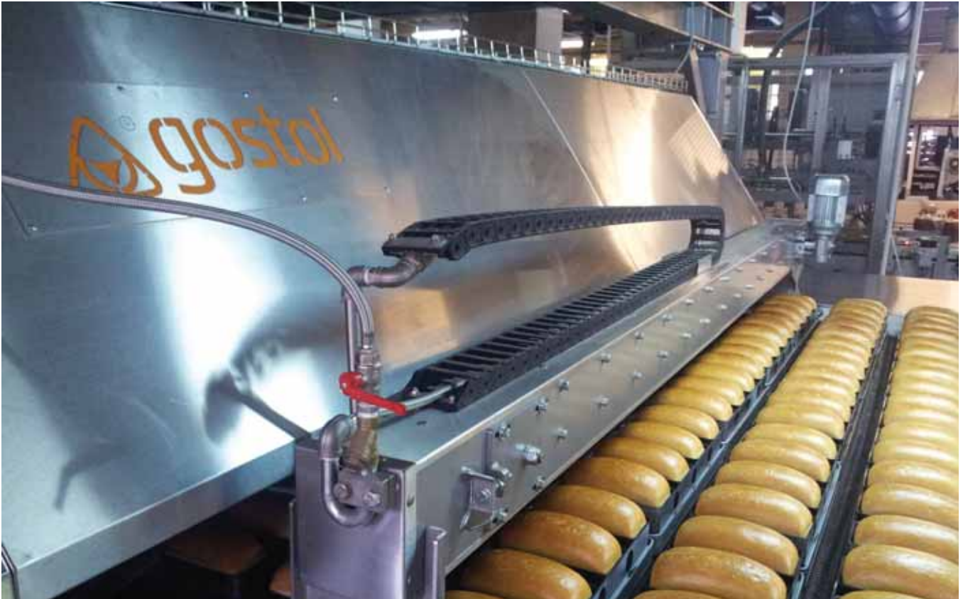
Gostol's reference bakery in Russia