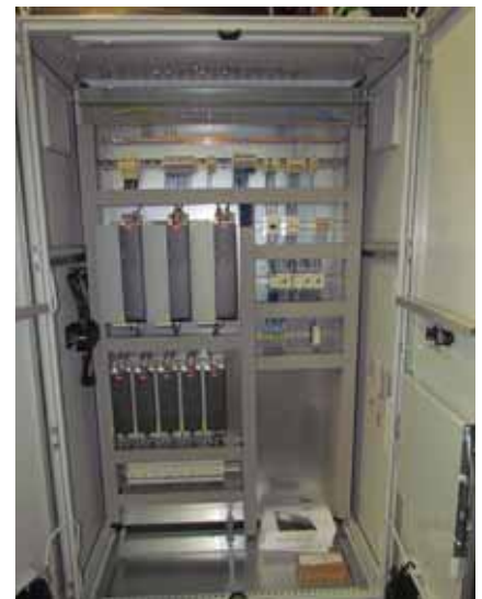
The same VLT® AutomationDrive family around the globe; here placed in Europe and USA