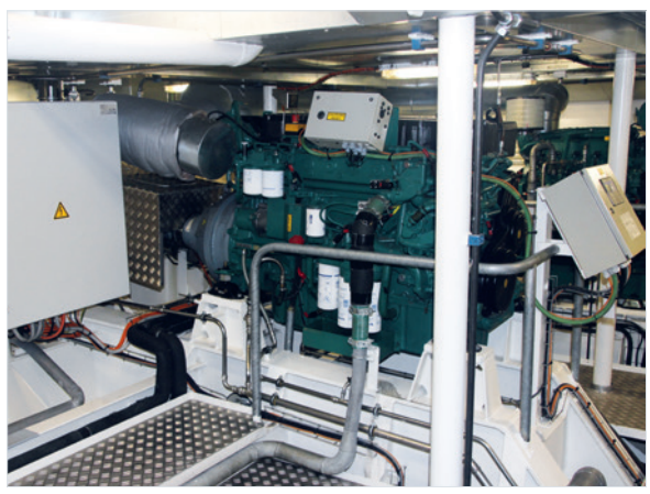
Volvo Penta marine diesel engine.

The double-ended ferry is powered by two identical Volvo Penta marine diesel engines with Schottel azimuth thrusters at each end of the vessel; each with its own engine room. There is full redundancy of the diesel propulsion.