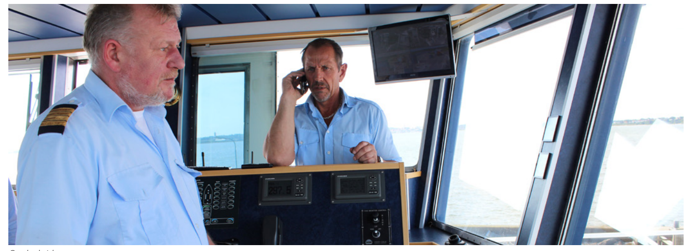
On the bridge