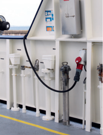
Staff connect to the shore power supply to commence charging the battery bank.