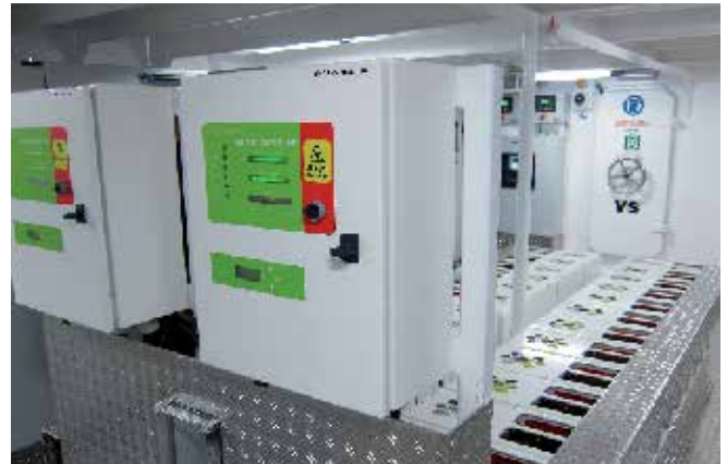
The 2 x 65 kWh Li-Ion EST-Floatch Battery system with battery management system.