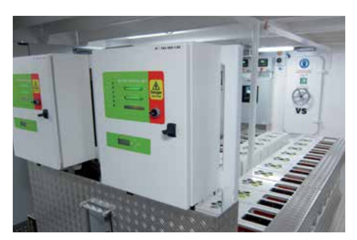
The 2 x 68 kWh Li-lon EST-Floattech Battery system with battery management system.