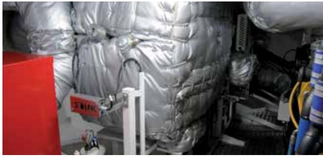
There are two 133 kW JohnDeere/Stamford generators in each engine room, four in total. The 2 engine rooms are located one at each end of the ship. The Solfic SCR exhaust gas filter removes toxic gases and