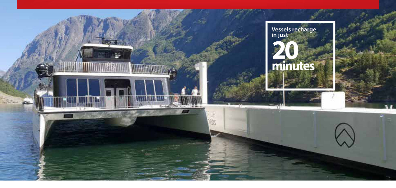
The PowerDock serves both fully-electric Future of the Fjords and its sister ship, the diesel-electric hybrid vessel Vision of the Fjords.