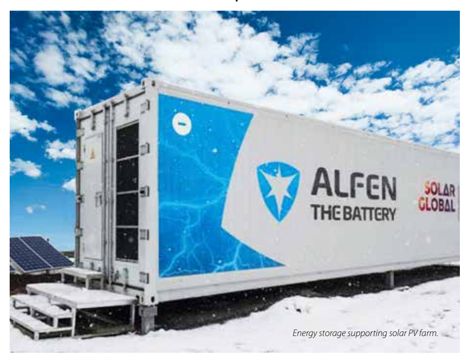
This project is supported by EU Regional Development Fund.

Solar Global develops and services solar photovoltaic (PV) farms and rooftop PV installations, and currently has some 100 MW capacity under service. As Solar Global wants to play an important role at the forefront of the energy transition, it is investing in an innovative energy storage solution that initially will be used for energy trading. As the local market further develops, the system is also ready for other applications, such as providing grid stability services.