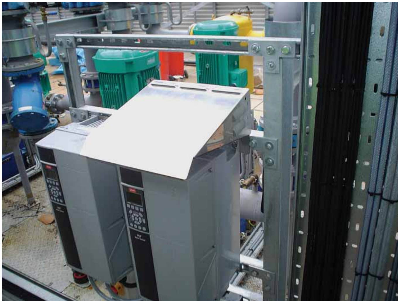
Danfoss FC series can withstand even the harshest pressure washing environments. A NEMA/UL Type 4X rated enclosure provides maximum mounting flexibility