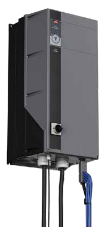
The PTU 025 is easily mounted into the FC 102 drive enclosure, and provides 360° access for optimal tube connections.

It is easily mounted into the enclosure of the VLT® HVAC Drive, and retrofitted existing drives.