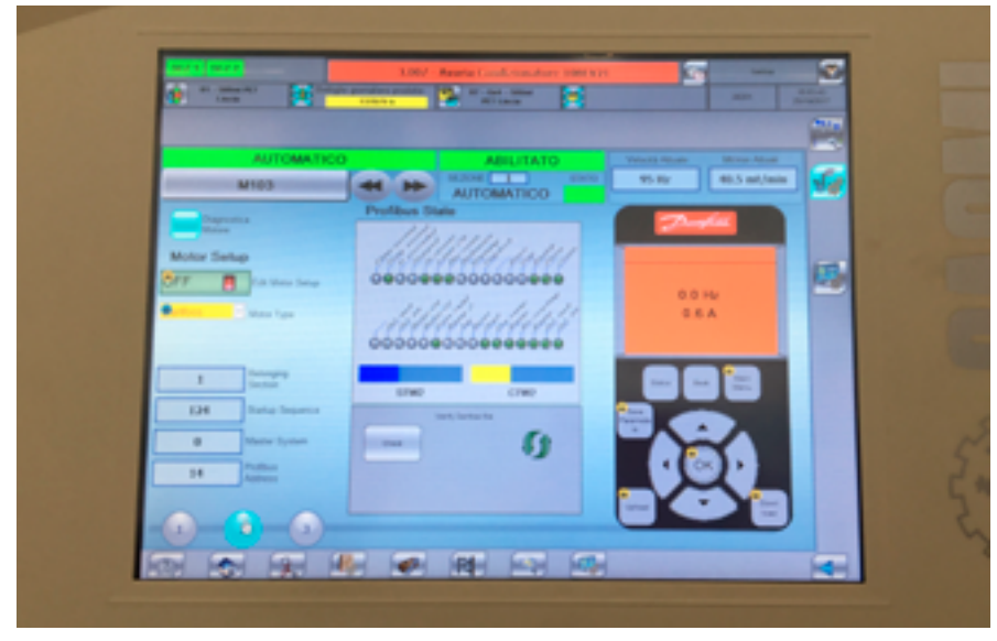
HMI for transporter automation where Sacmi replicated the LCP programming of the frequency converters to potentially modify the parameters of each device without needing to open the electrical cabinet.

The evolved automation system that Sacmi Filling was able to implement, thanks to the Danfoss VLT® FlexConcept drive system, not only avoided the direct use of sensors and related wiring, but provided even more significant added value with respect to competitiveness.