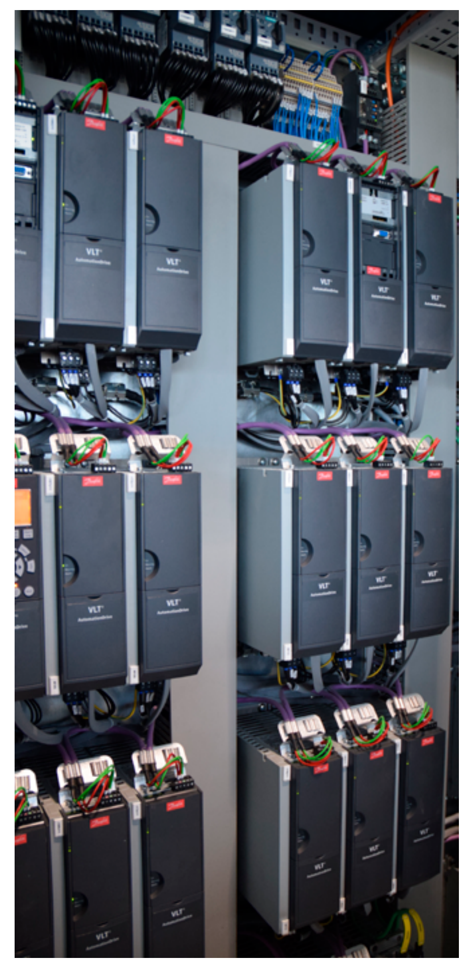
The Danfoss VLT® AutomationDrives, with suitable dimensions for the requirements of the transporter type installed on the cabinet, are designed to control the variable speed of all permanent magnet synchronous reluctance motors and made to increase flexibility and optimize the process control for any industrial machine or production line.

"The sensorless system" - observed Frosi – "quarantees services that are equivalent, if not superior, to those obtained by managing flows in a more conventional manner, using sensors and photocells. There is added value in the ability to guarantee maximum efficiency and continuity for the services provided. Indeed, you no longer need to deal with sensors and photocells that require maintenance and, if you accidentally tamper with or decalibrate them, you can significantly damage the process and create inefficiency. Especially on complex lines, for example, in the bottling industry."