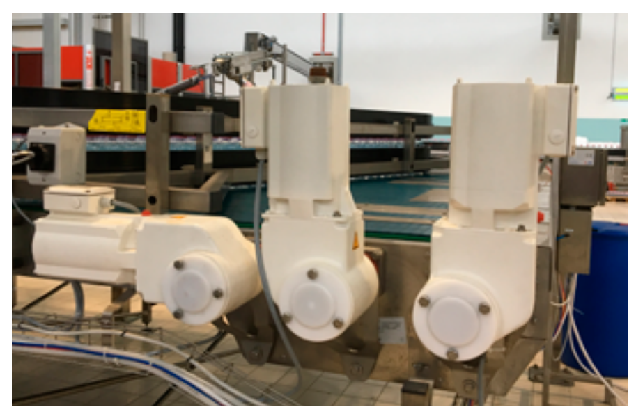
View of the Danfoss VLT® One Gear Drives, installed at the end of the line. IP 69K protection level fulfills requirements for the best hygiene and cleansing design.

"This process," concluded Forsi, "is in line with the specifics of Industry 4.0 and it can be managed and controlled via tablet and PC at all phases, for which progressive controls are planned so that any bottle that does not conform can be detected and removed without interrupting the cycle and, therefore, productivity."