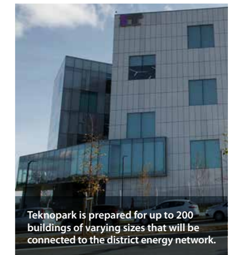
Teknopark is prepared for up to 200 buildings of varying sizes that will be connected to the district energy network.