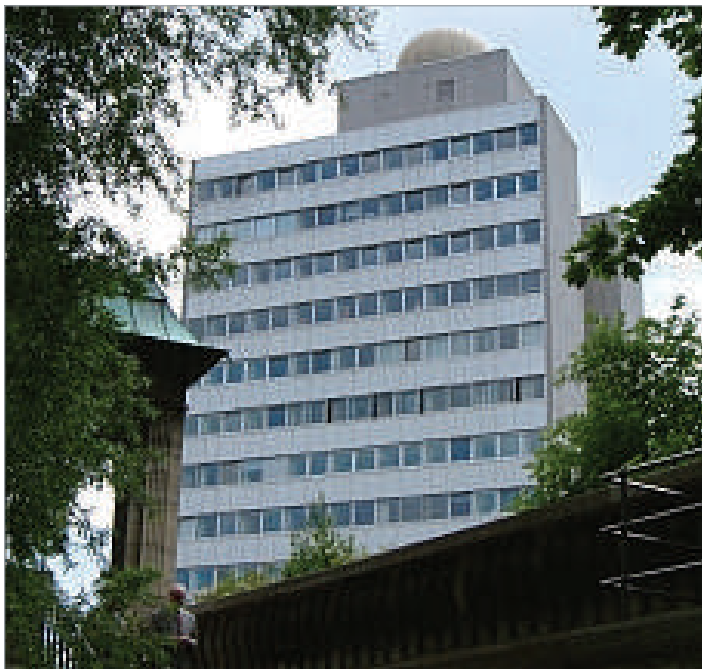
The SEM-SAFE® nozzles blend in with the architectonic design scheme.

Considering especially the high value of the ongoing research projects in the laboratories, the owner clearly expressed a preference for a system that would keep fire damage at an absolute minimum, while limiting water damage in case a fire should break out. With this in mind, SEM-SAFE® high-pressure water mist from Danfoss for fire protection was chosen. The system was installed and commissioned in collaboration with our the Danfoss business partner, Callies Brandbekämpfungssysteme GmbH.