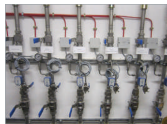
Danfoss' high-pressure VDHT valves are made from stainless steel and are highly corrosion proof and dirt resistant.