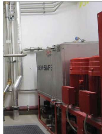
The unique and compact Danfoss pumps offer up to 95% energy efficiency and very low pulsation, thus reducing noise.

Standing at an impressive 17 stories, with 10,000 m 2 floor space, the building is classified OH2 hazard (144 m 2 ). It is separated into 21 sections (17 floors and 4 installation chutes). The pump employed is a 4xPAH 80 system with a capacity of 448 litres/minute at 120 bar. The pump unit tank holds 1,200 litres and is connected with two booster pumps to a second water tank at the lowest building level with an additional capacity of 9,500 litres. The system is additionally connected to the public water supply in Berlin and to an extra water supply station operated by the Berlin fire department. The building has been fitted with 1,250 nozzle heads as well as some 6,000 metres of piping.