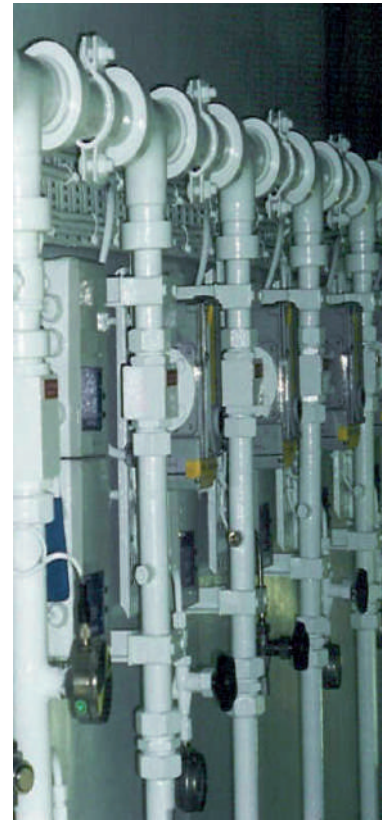
Typical arrangement of section valves in an engine room.