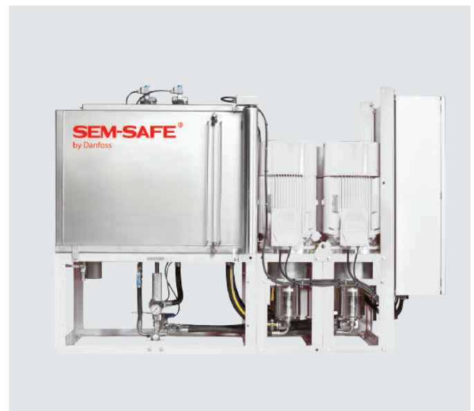
A typical SEM-SAFE® high-pressure unit fitted to yacht applications.