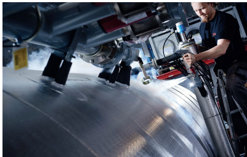
Danfoss Fire Safety annual service on a SEM-SAFE® low-pressure CO 2 system