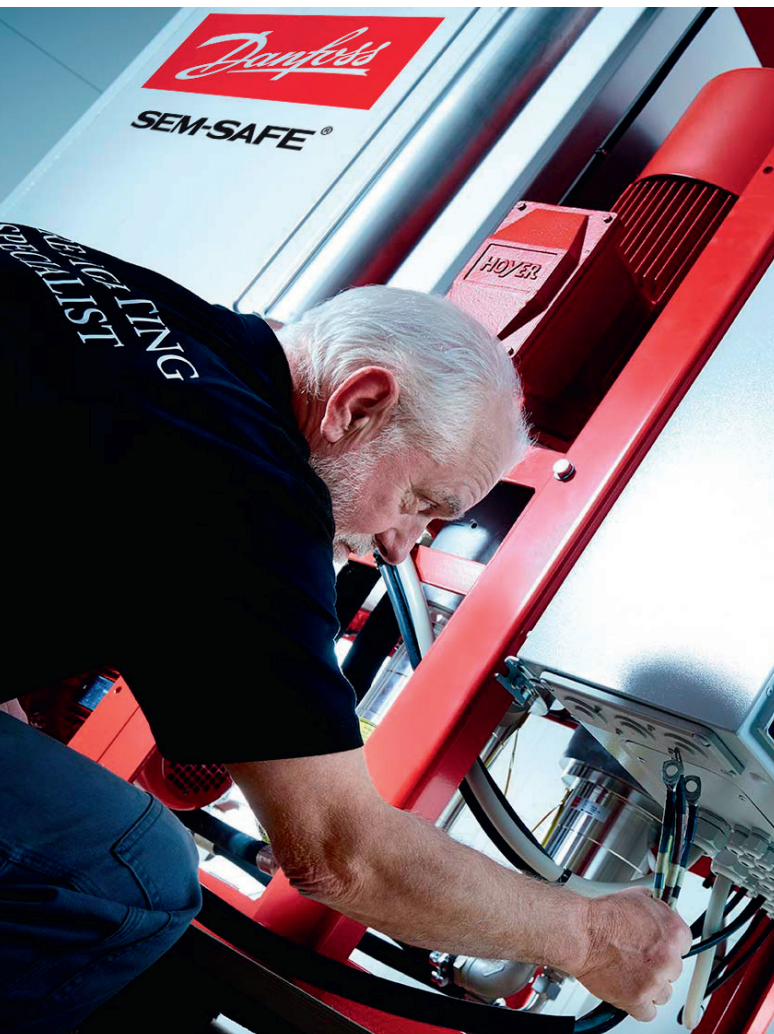
Technical Supervisor performing service on a SEM-SAFE® high-pressure water mist system

Do you need spares, but you don't know exactly which ones? Do you have a problem and can't find the cause? Our technical support staff are ready to assist you with issues like these, and many more. In addition, we have an extensive documentation database to help us to track down the components and spares you need.