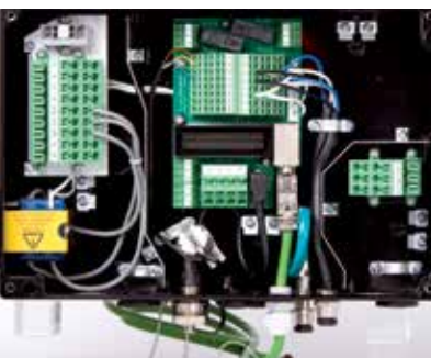
The FCD 302 connection box with integrated T-distributors allows for rapid installation and commissioning.

1 Mounted on panel outside hygiene-critical area/wet area.