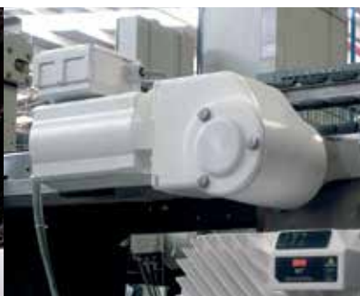
The VLT® OneGearDrive® Standard with a terminal box (an optional brake is available).