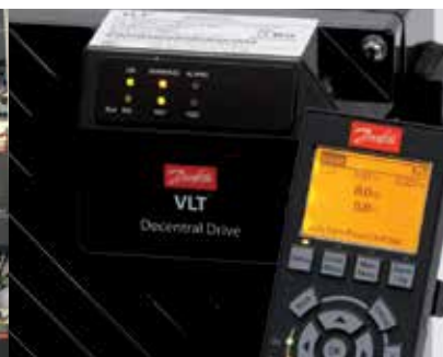
For simple parameterization, LCP 102 (the graphical control unit of the FC series) can be connected.