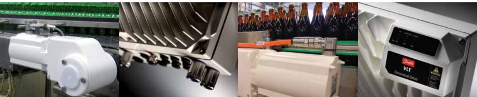
A cover is always provided for protection and to complete the hygienic design.