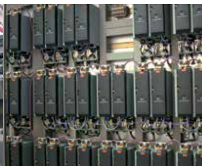
The VLT® AutomationDrive FC 302 is available for centralized installation.