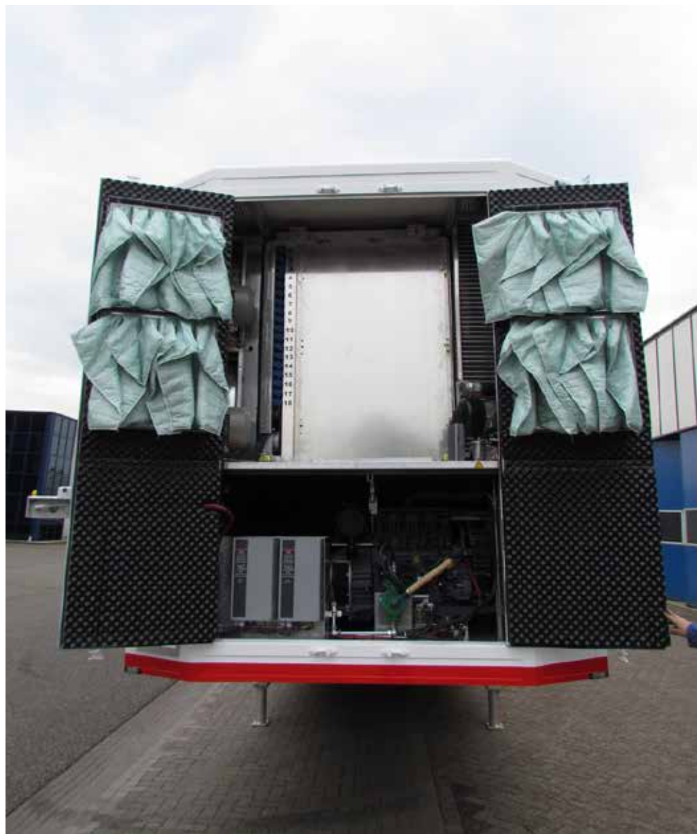
Installation front trailer

The ventilation prevents temperatures rising too high, for instance when the truck is stuck in a traffic jam in summer. In a trailer without effective ventilation the temperature would increase very quickly, something that the pigs don’t handle very well. Trucks that are used in colder climates may be equipped with a heater to pre-heat the ventilation air.