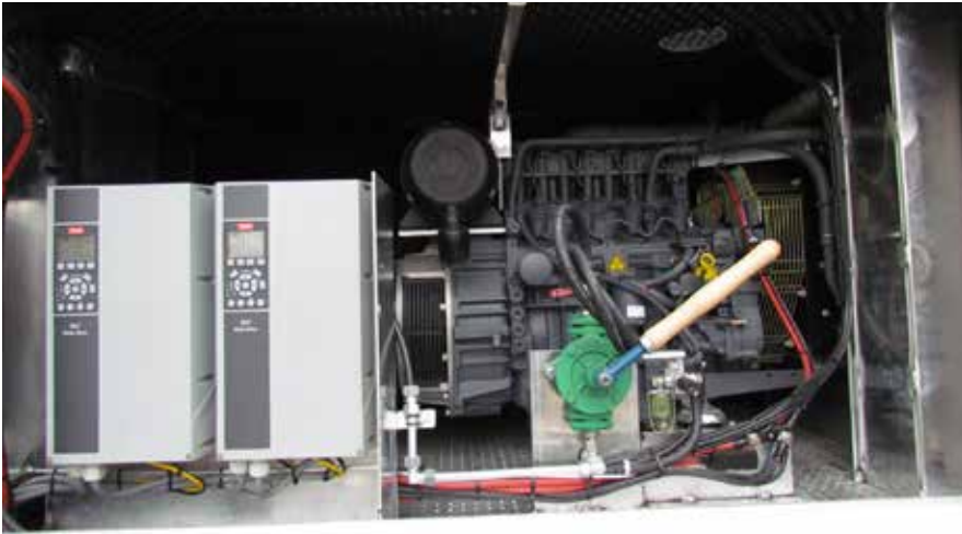
Two VLT® HVAC Drive FC 102 units provide infinitely variable fan speed control.