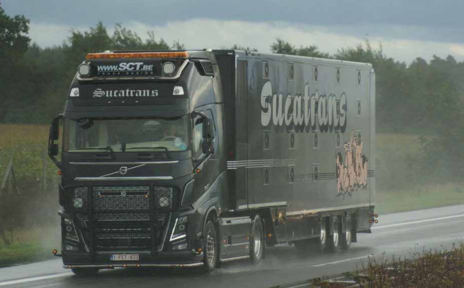
New trailer equipped with cross-ventilation from Cuppers Carrosserieën, on the road.