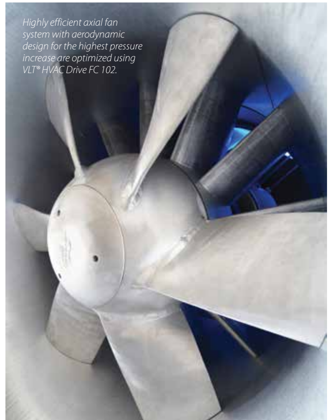
Highly efficient axial fan system with aerodynamic design for the highest pressure increase are optimized using VLT® HVAC Drive FC 102.