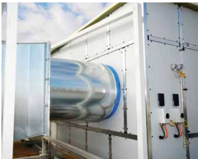
Connection between fan outlet and duct system

The ventilation had to be completely renewed for one of the largest production buildings at the factory. Higher air volumes were needed and the space available for the installation of the equipment was insufficient. Therefore, a new installation location for the AHUs had to be found on the roof. The large 80,000 m 3 /h units were placed on a steel platform on the connection between two buildings. In addition to saving energy, the criteria unit size, weight saving and noise reduction were therefore also key requirements.