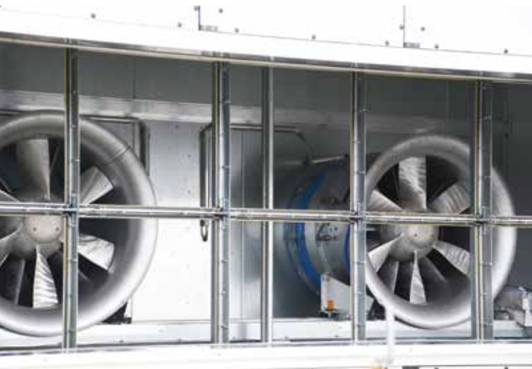
NOVENCO ZerAx® axial fans in parallel operation.

Through innovation and impressive planning at the site, the goal is to continuously reduce energy consumption and the associated CO 2 emissions.