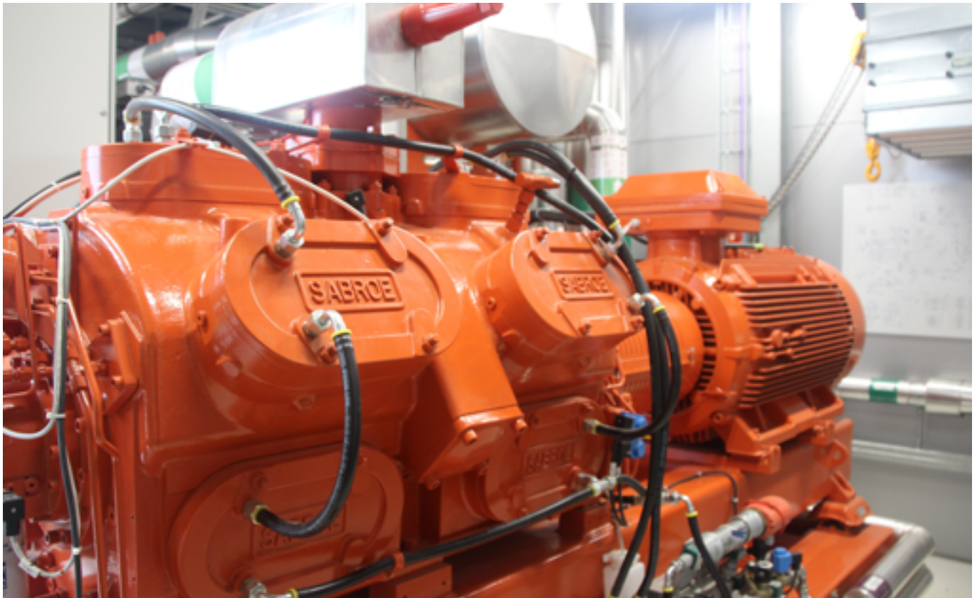
The variable speed drive-controlled heat pump sends 70°C – 80°C water out into the system, and approximately 40 °C water comes back to the plant. The plant was supplied and installed by Johnson Controls Aps with consultancy from COWI A/S.

the district heating supply, where heat pumps with thermal storage use the power when it is plentiful and therefore inexpensive; and avoid using it in periods with peak loads in the system, for example, late afternoon, when most people come home from work and turn on lights and household appliances. HOFOR's FlexHeat project in Copenhagen's Nordhavn is a prime example of this type of sector coupling. The thermal energy storage corresponds to a "virtual battery" of 4 MWh.