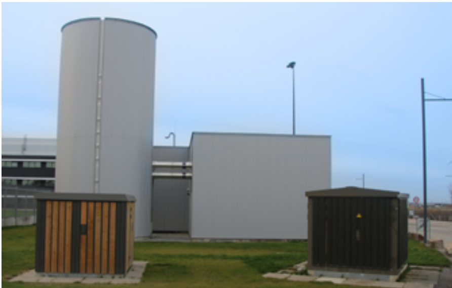
The FlexHeat plant stores thermal energy corresponding to a virtual battery of 4 MWh in the 100-m 3 storage tank on the left side of the image.

"Smart-operation of the facility is based on electricity prices and a weather prognosis, where we take into consideration the power consumption viewed historically under similar weather conditions. Along with current operation data, these data are fed into an algorithm, which helps us work out a plan for the next day's use of electricity. The machine learns a bit every time, getting smarter and smarter because of the data that we feed into the system. This type of machine learning will make us even better in the future at operating the facility according to favourable electricity prices."