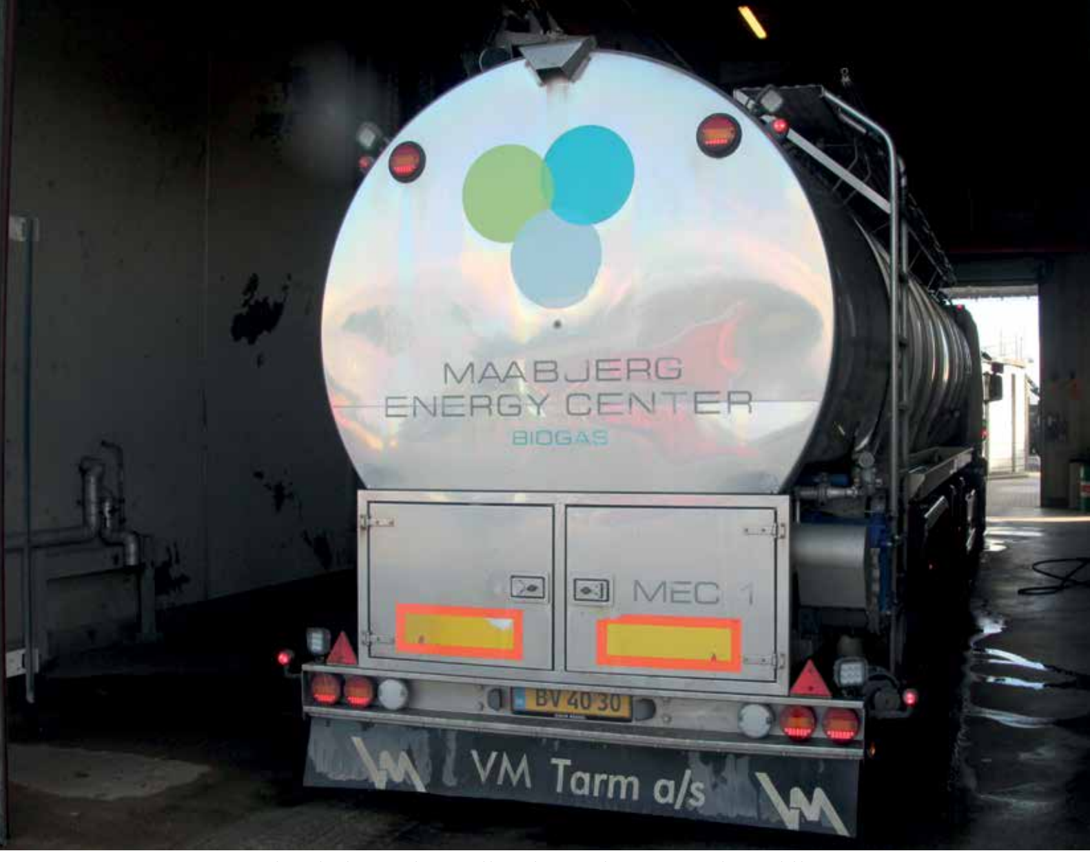
VLT® AutomationDrive FC 302 controls critical applications, such as pumps, blowers, decanters and screw conveyors, and ensures reliable operations at MEC – BioGas.