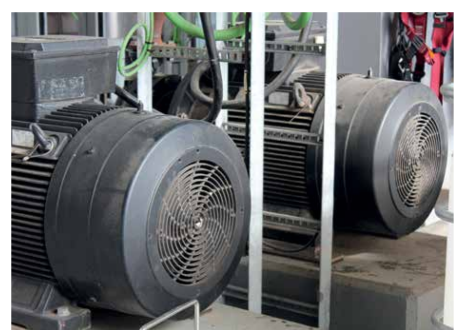
The VLT^{\circ} AutomationDrive FC 302 drives control the large district heating pump systems.