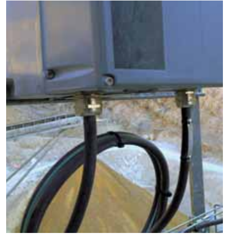
Built-in fieldbus options simplify cabling.