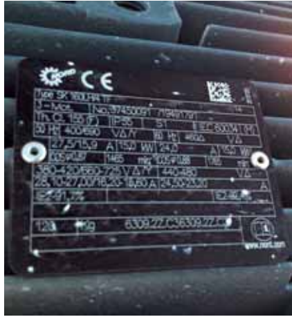
Danfoss AC drives are independent of motor technology.