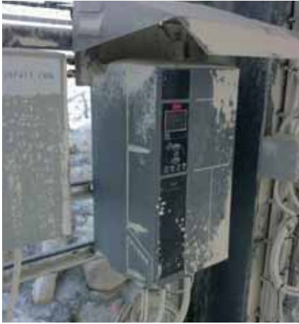
VLT® AutomationDrive operates reliably in harsh conditions.