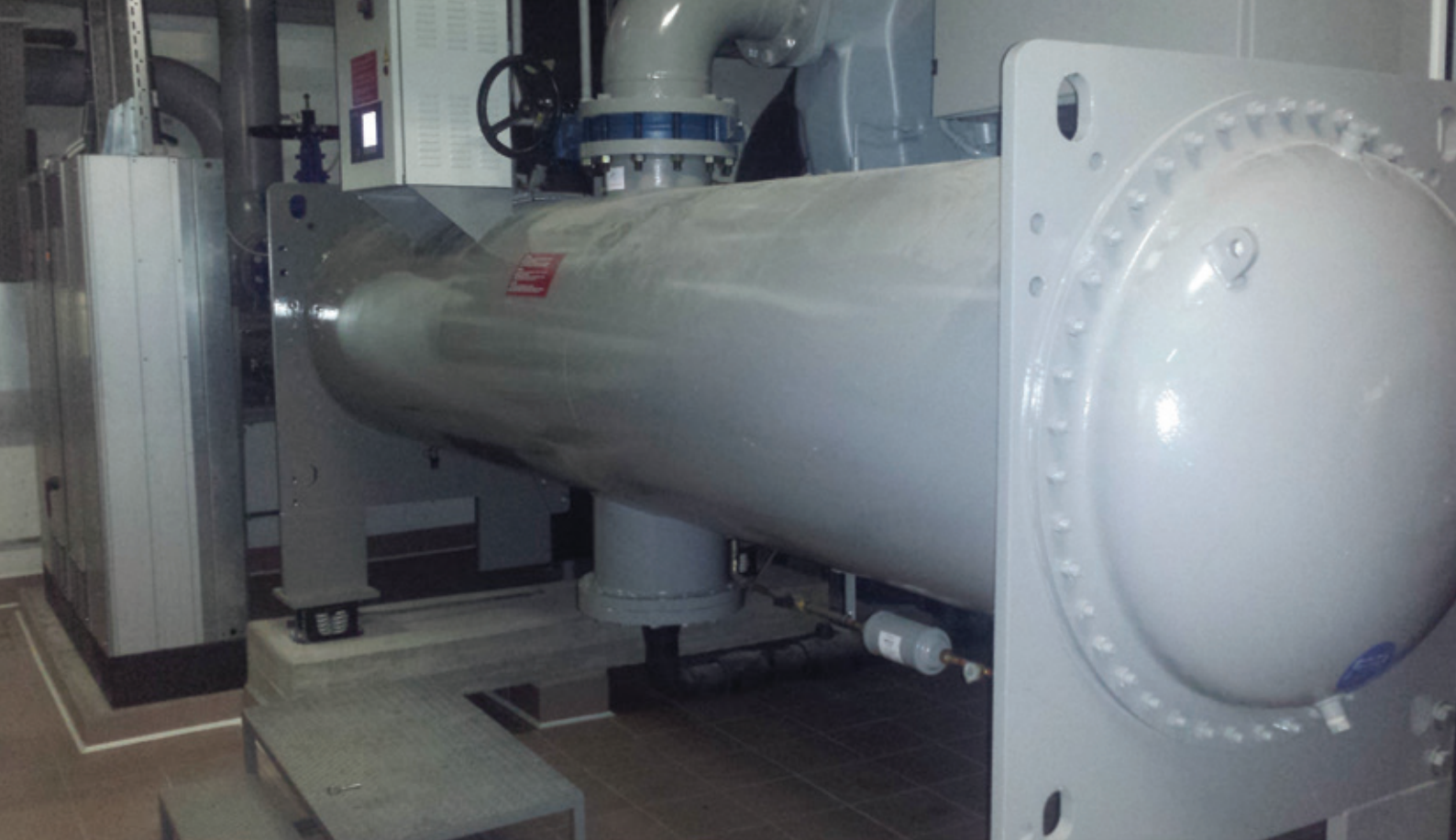
Two 19XR compressors with 2245 kW of cooling power and 375 kW of electrical power now service the cooling system.