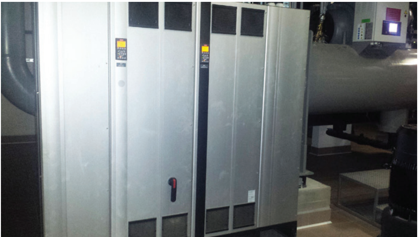
These VLT® Low Harmonic Drives control the new compressors in the technical room.

In agreement with the designer and the hospital, Danfoss suggested the active solution VLT® Low Harmonic Drive (LHD), where the AC drive and active filter are combined in one unit. The active filter is assembled parallel to the AC drive input; therefore, the AC drive operates normally in the event of filter malfunction and provides operation of the cooling system. Important factors taken into account by the hospital when adopting the decision were the list of spare parts, 24/7 service support, and smooth commissioning.