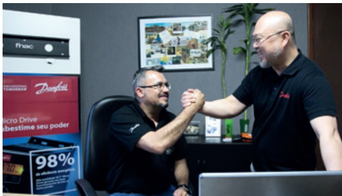
Danfoss representatives collaborate with the Coca-Cola FEMSA maintenance team in decision making.