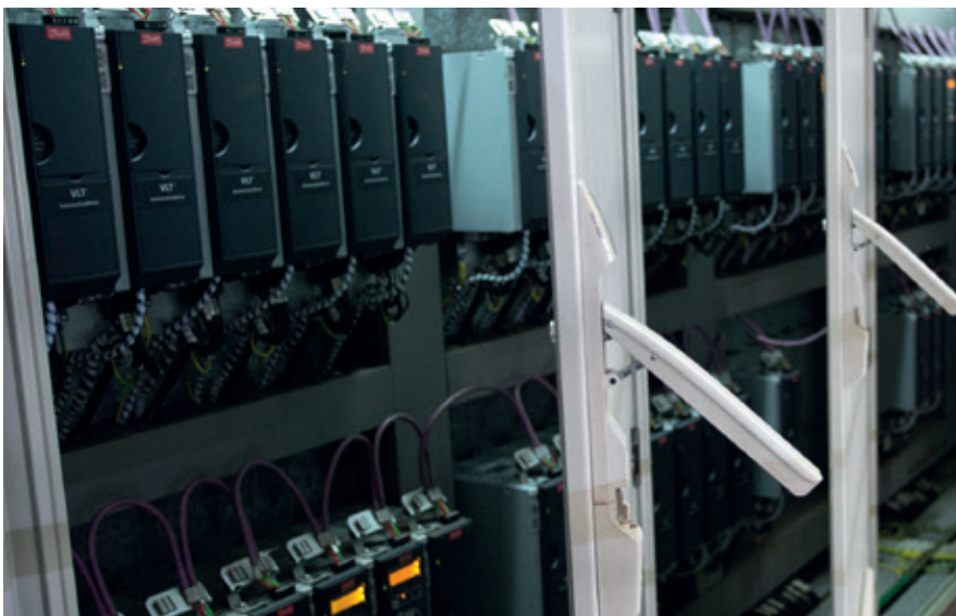
... and centrally mounted.