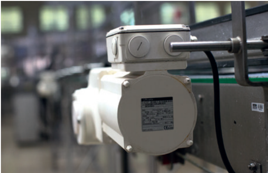
VLT® drives control the speed of the bottling line conveyors, both decentrally ....

The DrivePro® Services program offered in Brazil ensures the maximum productivity level of the bottling lines in the Coca-Cola FEMSA factory in Maringá, Paraná.