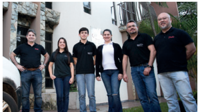
EPS Service delivers Danfoss DrivePro® services to the Maringá factory