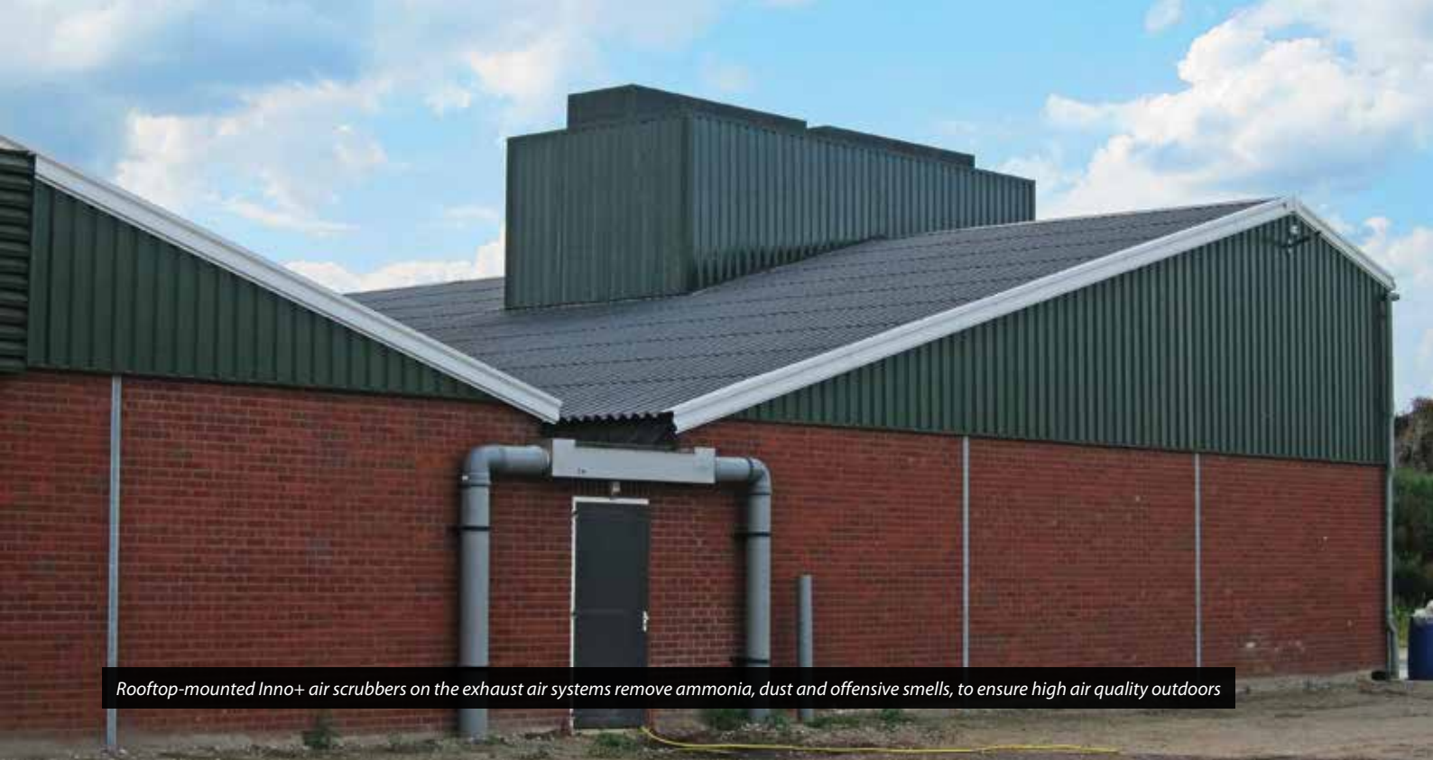
Rooftop-mounted Inno+ air scrubbers on the exhaust air systems remove ammonia, dust and offensive smells, to ensure high air quality outdoors