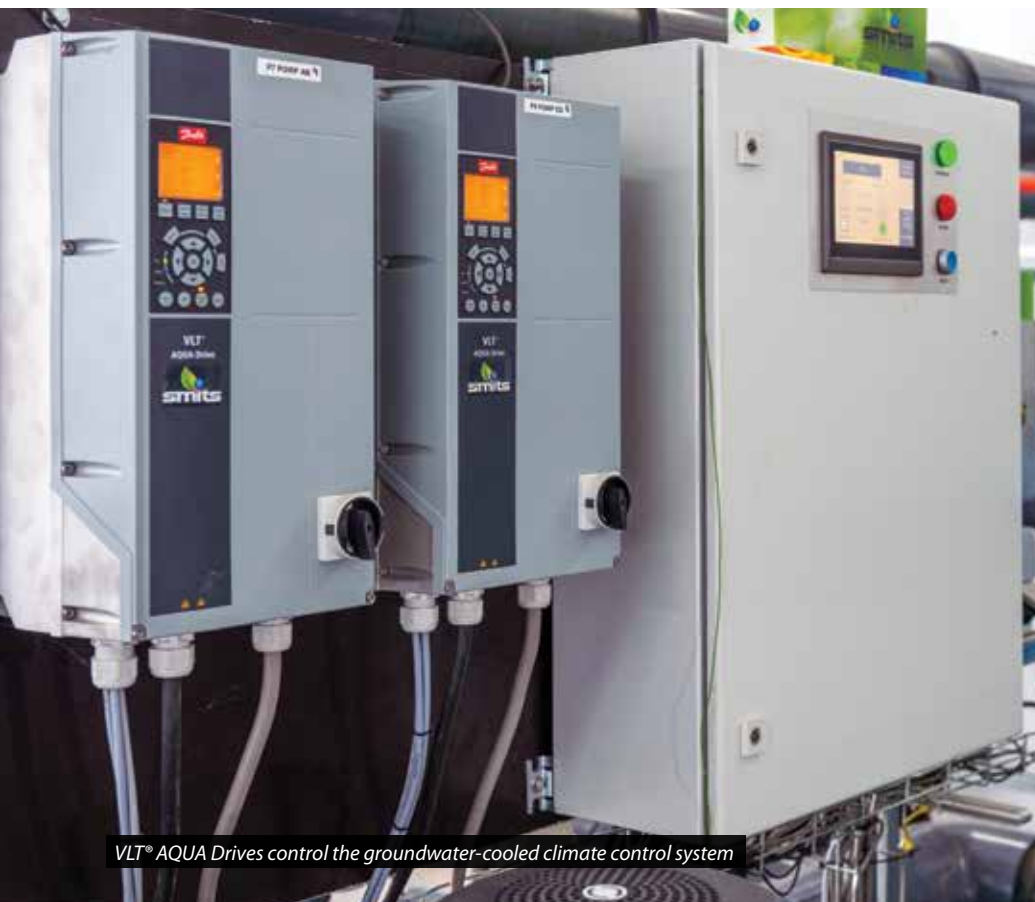
VLT® AQUA Drives control the groundwater-cooled climate control system

– Erwin Stienen, CEO, Stienen Bedrijfslektronica B.V.