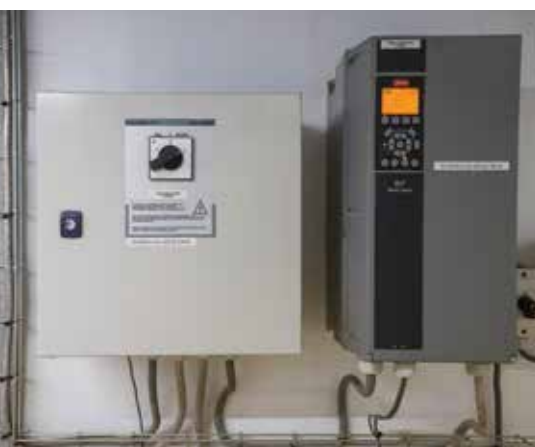
▲ A robust IP55-rated VLT® drive controls the Stienen climate solution equipment.

His combination of sustainable entrepreneurship and a genuine passion for pig farming has proved to be a successful model for how modern farms can be run in an increasingly competitive international market. In fact, his company, the Van Asten Group, now has six locations in Holland and Germany – with an annual turnover of 70 million Euros.