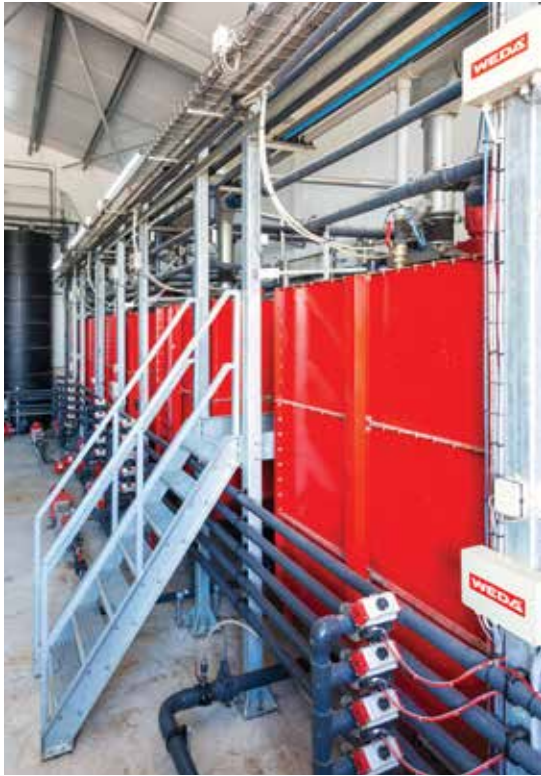
▲ Weda fermented wet feeding system