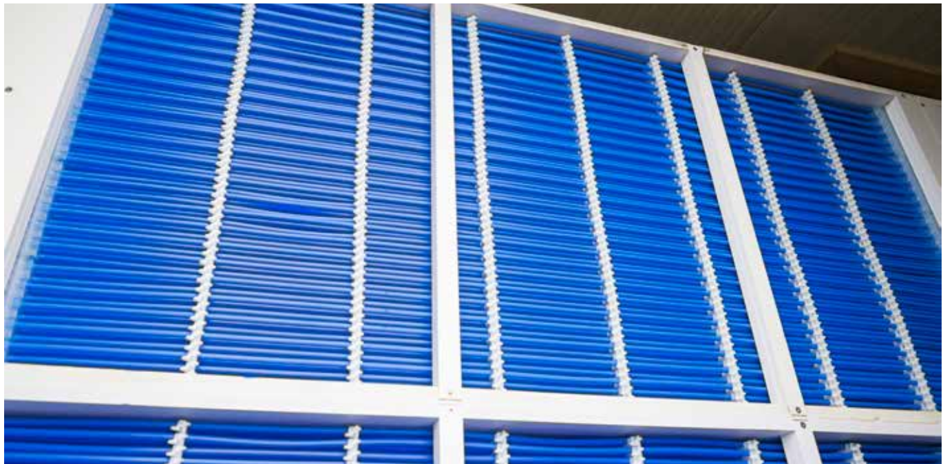
▲ Exegy corrosion-free heat exchangers installed by Inno+ as part of the advanced climate and heat recovery system.