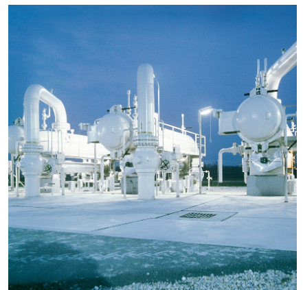
The Schiebel actuators provide precision control for a wide range of industries, even in extreme climates and harsh environments.