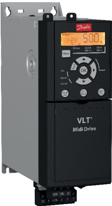
VLT® Midi Drive FC 280