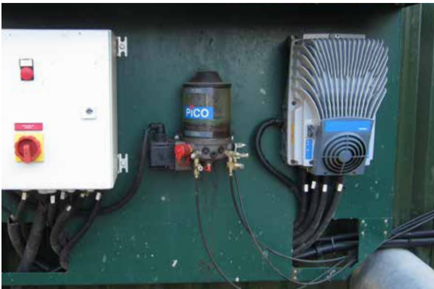
VACON® 100 X installed outdoors. To turn the paddle agitator and ensure optimal operation, a VACON® 100 X AC drive and an automatic central lubrication unit are used.

This case story was originally released before the merger of Vacon and Danfoss Power Electronics was fully completed on 15 May 2015. As a result, Vacon as a company brand no longer exists and contact persons mentioned in the story may have changed. Future case stories on VACON® products will be released on behalf of the new organization – Danfoss Drives – which is part of the Danfoss Group.